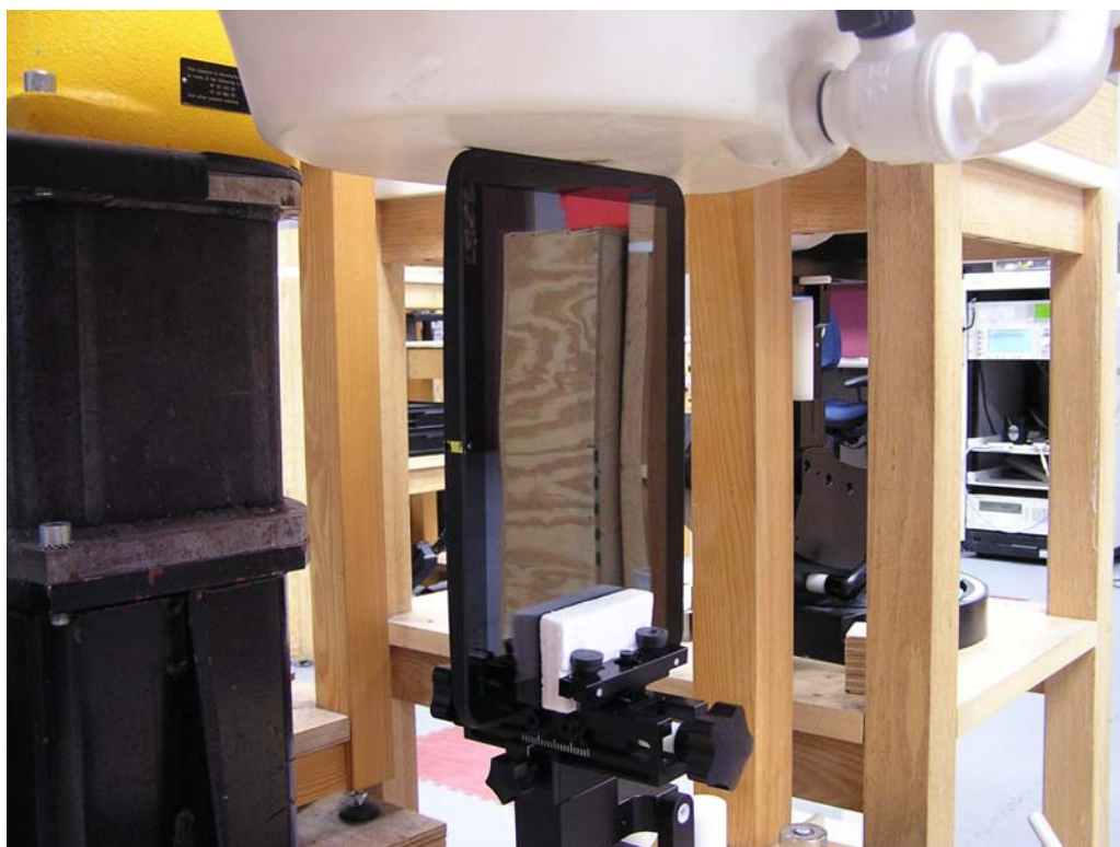
Figure 6: Right Edge of DUT toward Phantom, 0 mm Separation