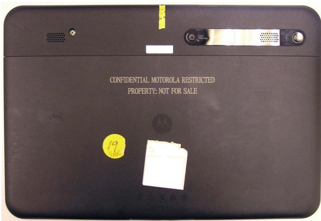
Figure 2: DUT Back Surface