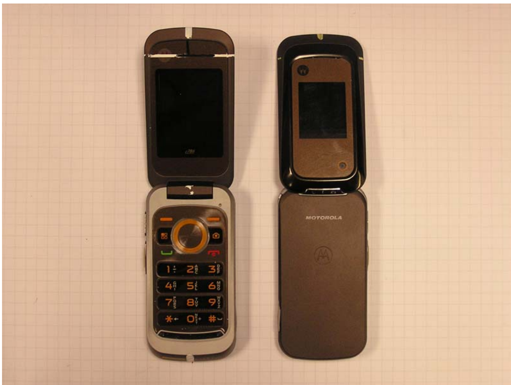
Figure 2: Phone Front and Back, Flip open