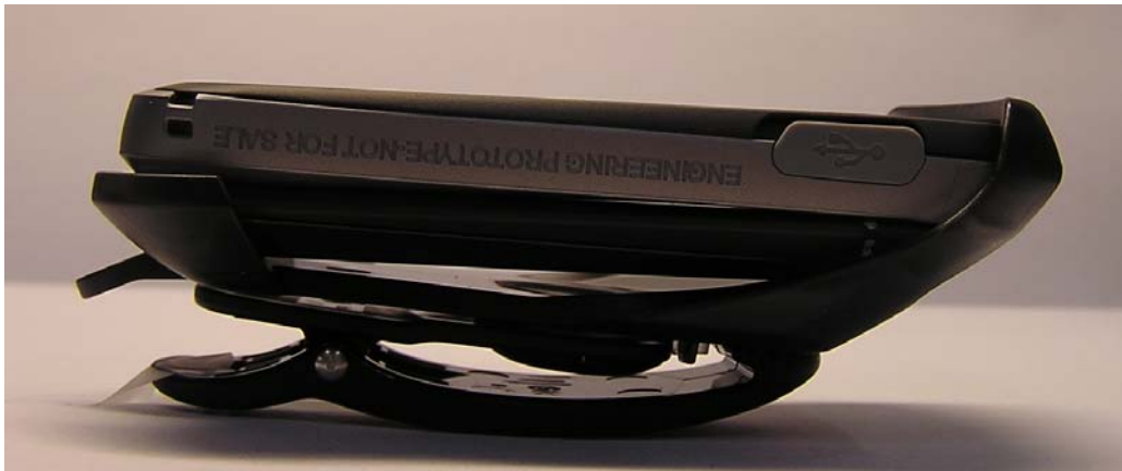
Figure 4: Phone with Holster