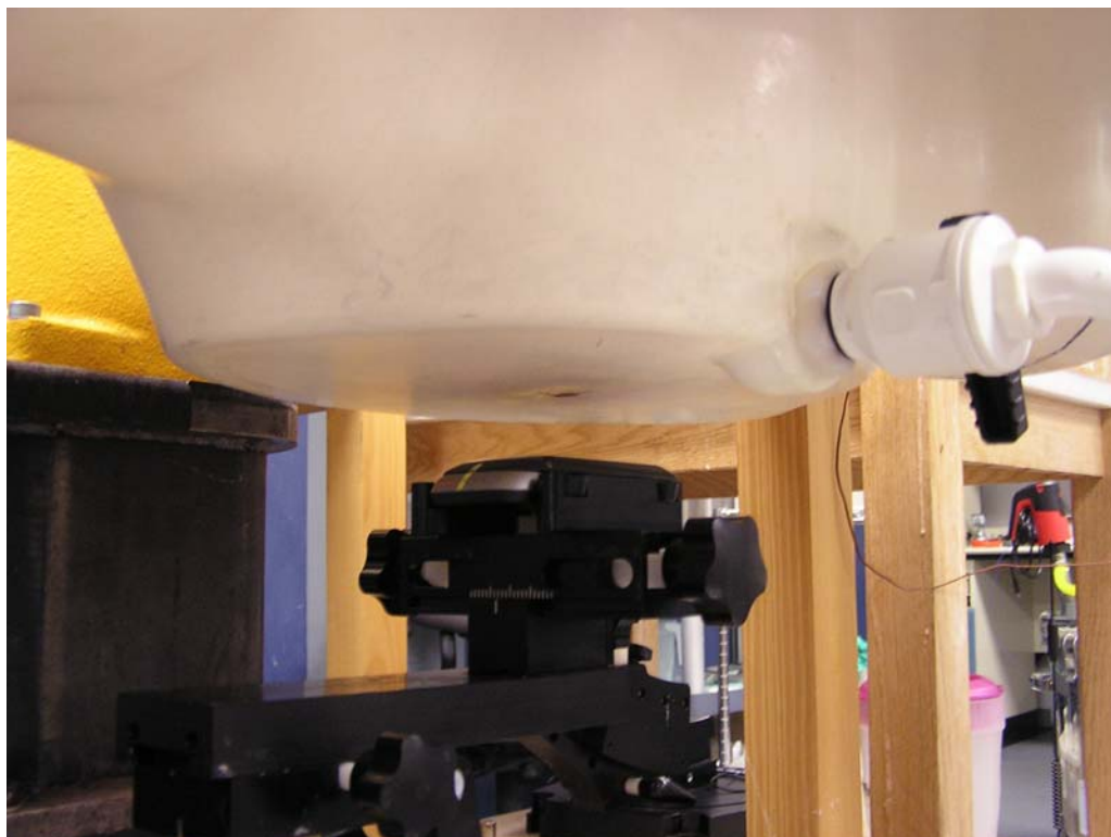
Figure 10: Dispatch/Push-to-Talk Position, Flip Closed