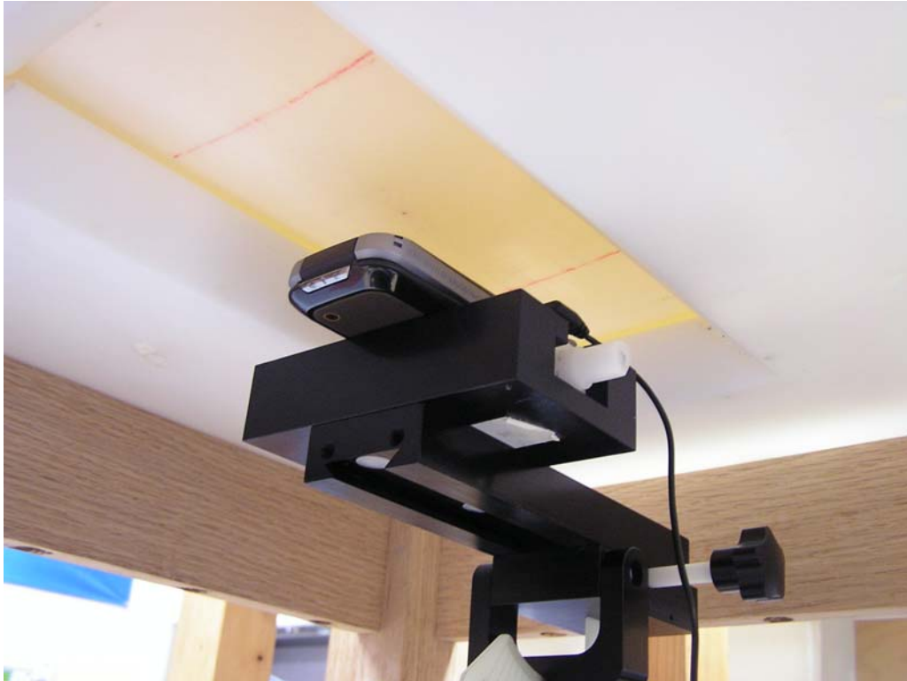
Figure 11: Body Position