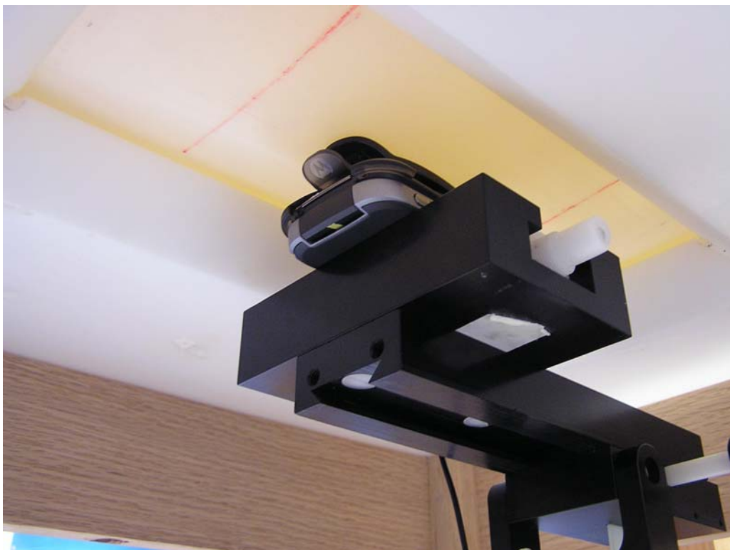
Figure 12: Body Position with Holster