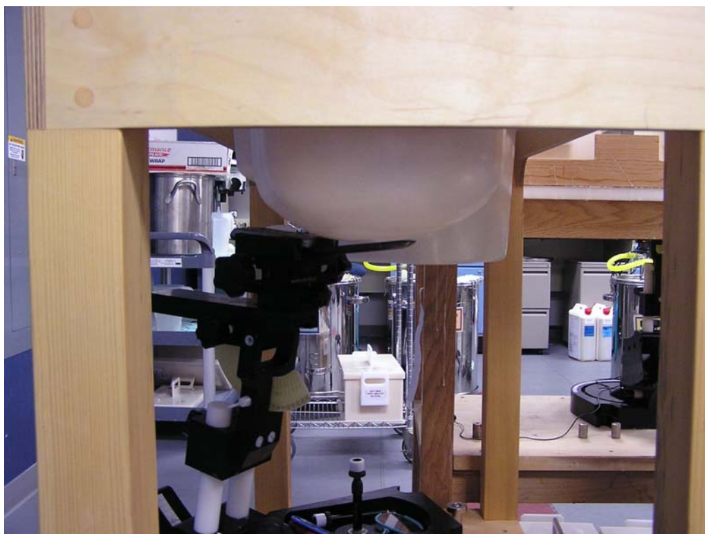
Figure 6: Cheek Position, Top of Head of Phantom