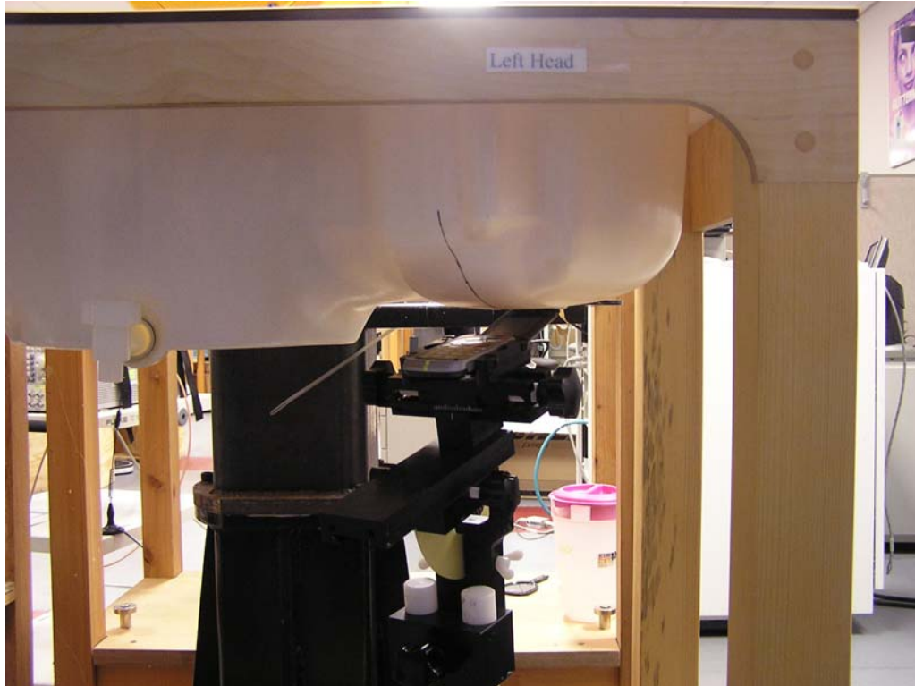
Figure 7: Tilt Position, Front of Head of Phantom