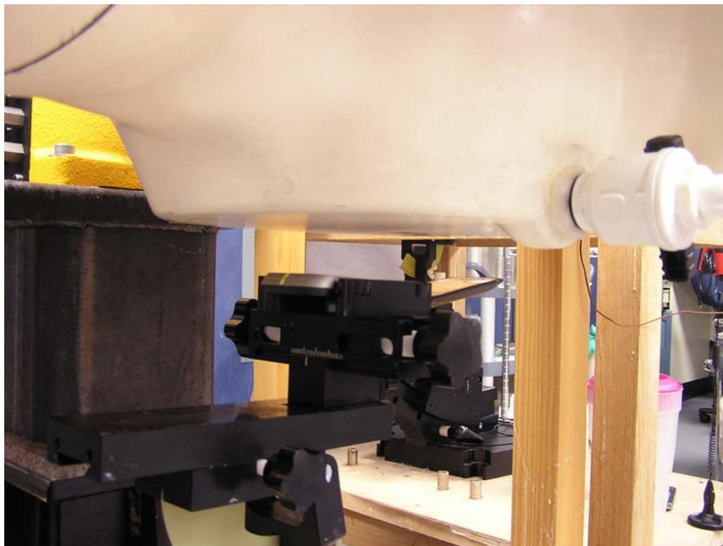
Figure 9: Dispatch/Push-to-Talk Position, Flip Open