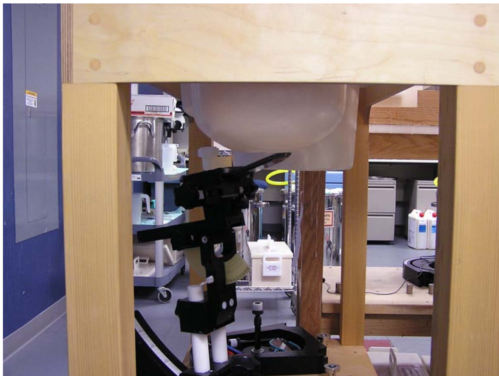
Figure 8: Tilt Position, Top of Head of Phantom