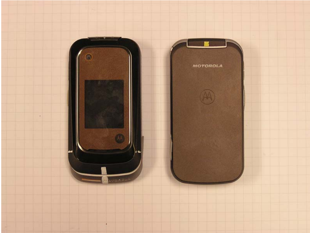
Figure 1: Phone Front and Back, Flip closed