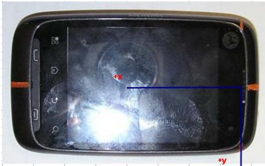
Figure 6. Coordinate Axis for T-coil Measurements