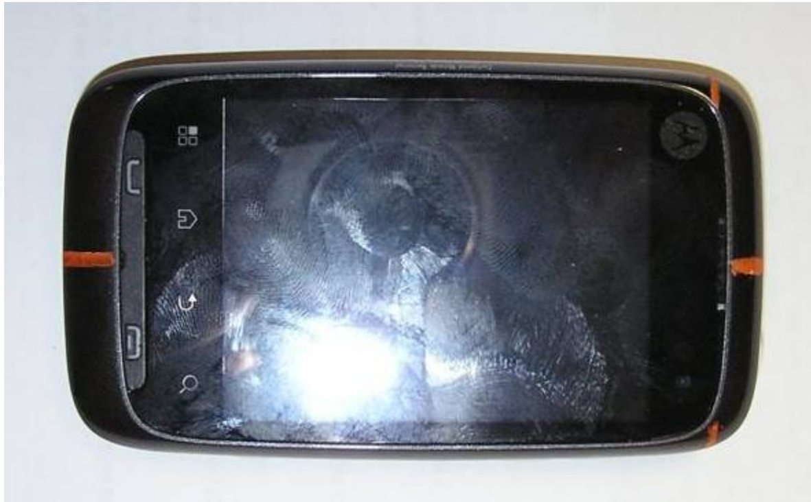
Figure 1. Phone Front