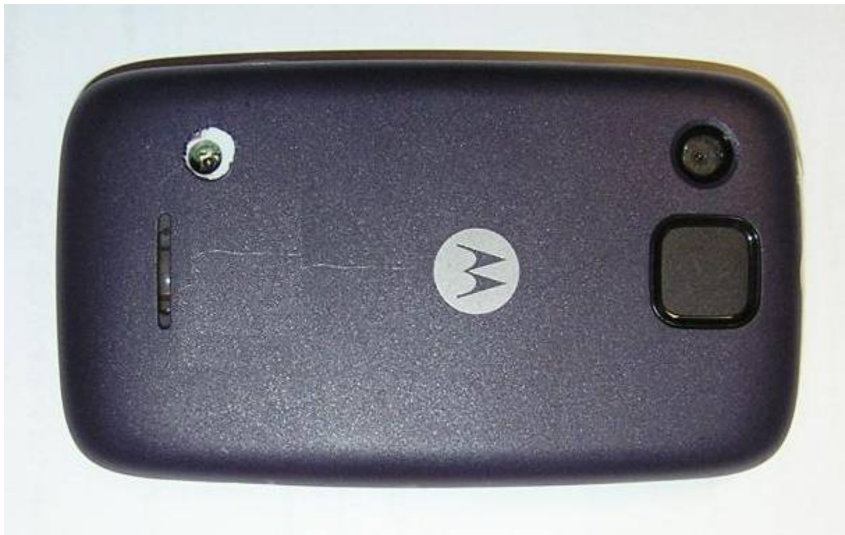
Figure 2. Phone Back