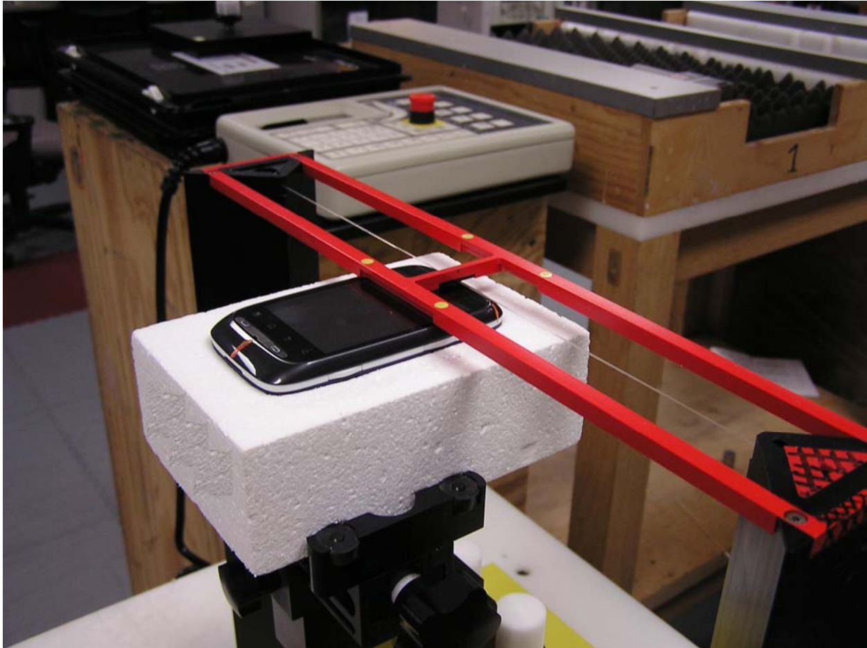
Figure 3. Positioning and Measurement for RF Emissions