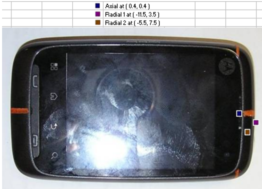
Figure 7. Location of Measured Points for T-coil measurements