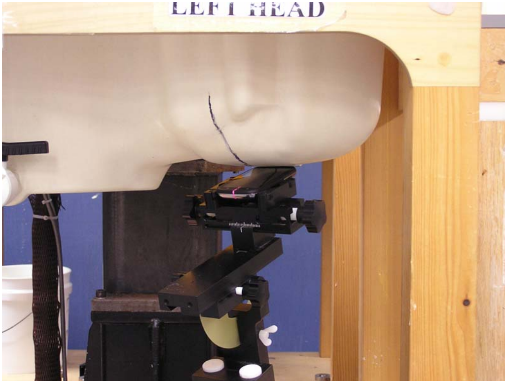
Figure 5: Tilt Position, Front of Head of Phantom