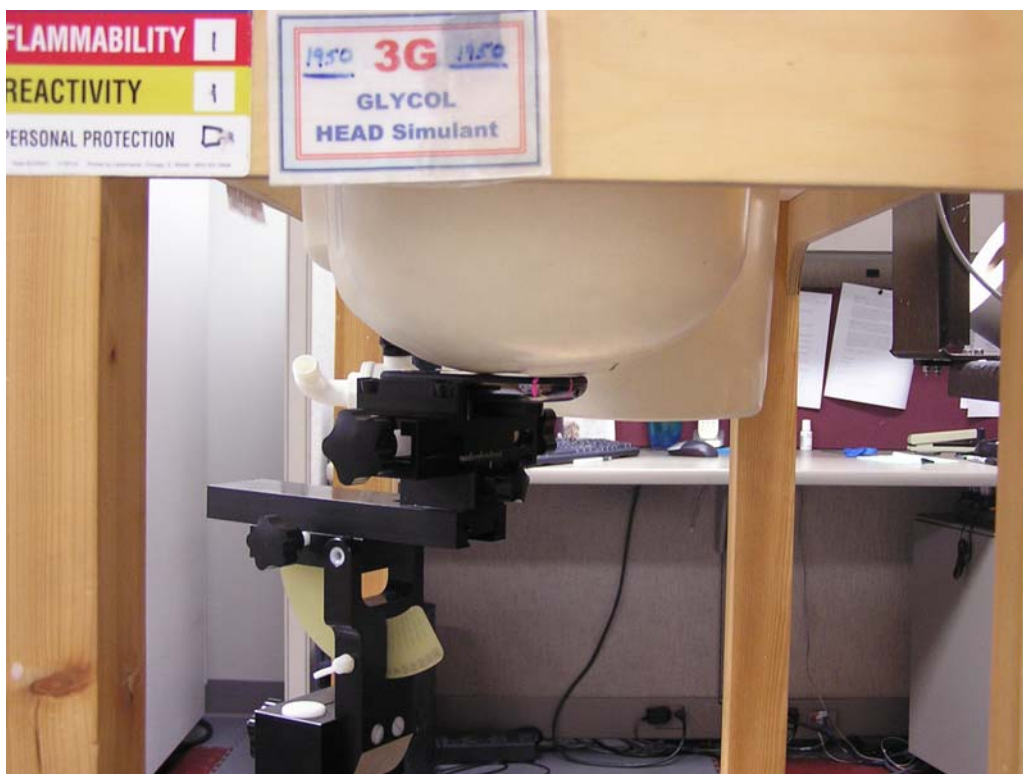
Figure 4: Cheek Position, Top of Head of Phantom