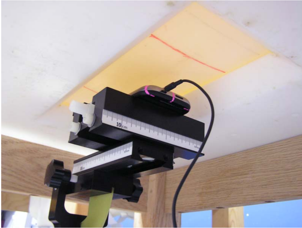
Figure 7: Body Position