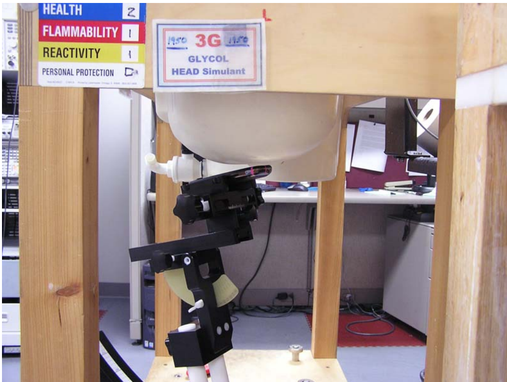
Figure 6: Tilt Position, Top of Head of Phantom