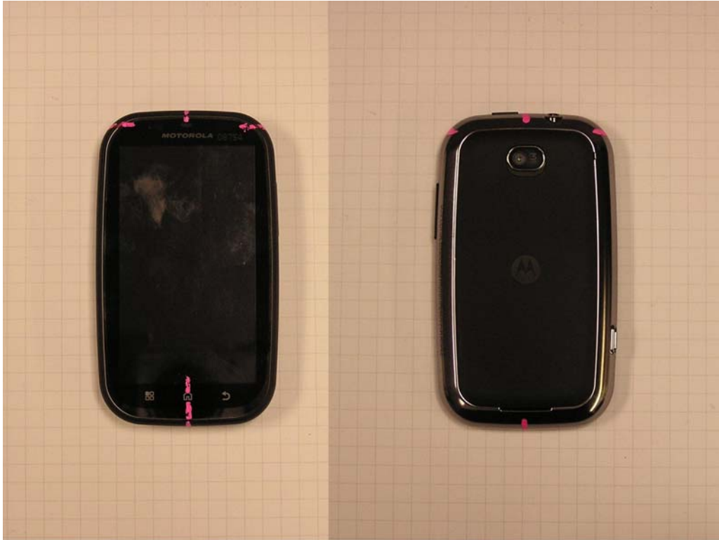
Figure 1: Phone Front and Back