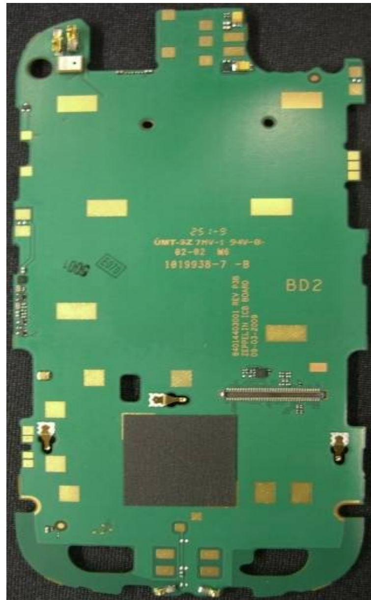
ICB Bottom Side