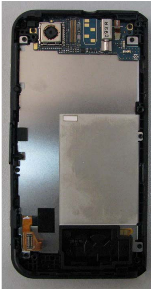
Inside front housing