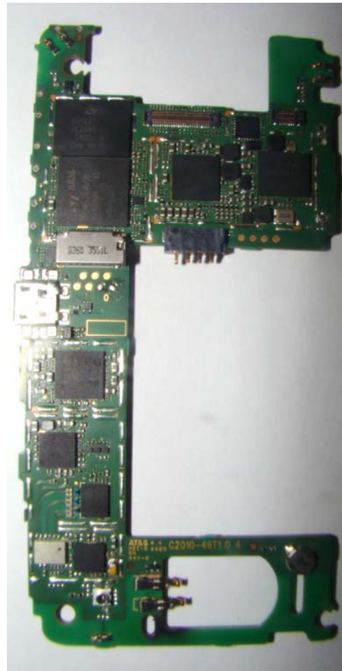
Main PCB top without shields