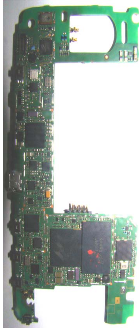
Main PCB bottom without shields