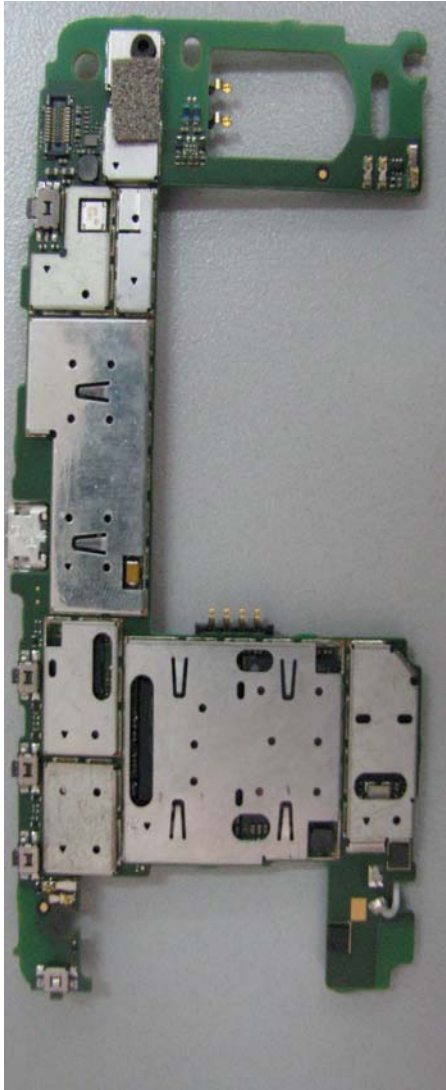
Main PCB bottom with shields