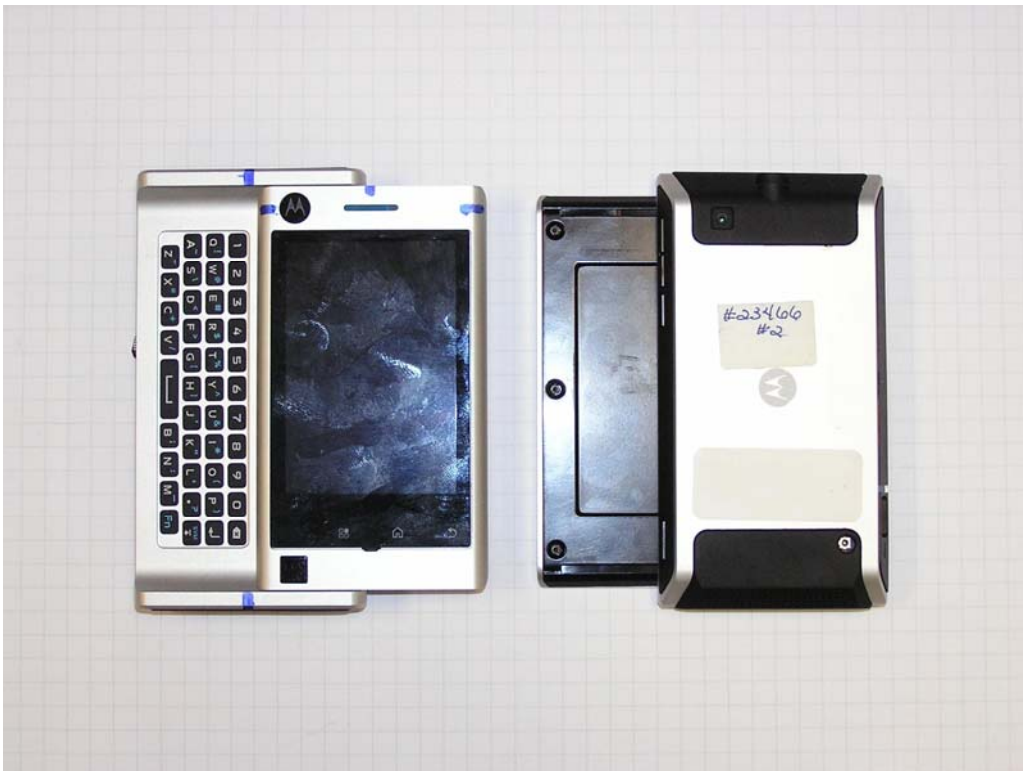
Figure 2: Phone Front and Back, Slider Extended