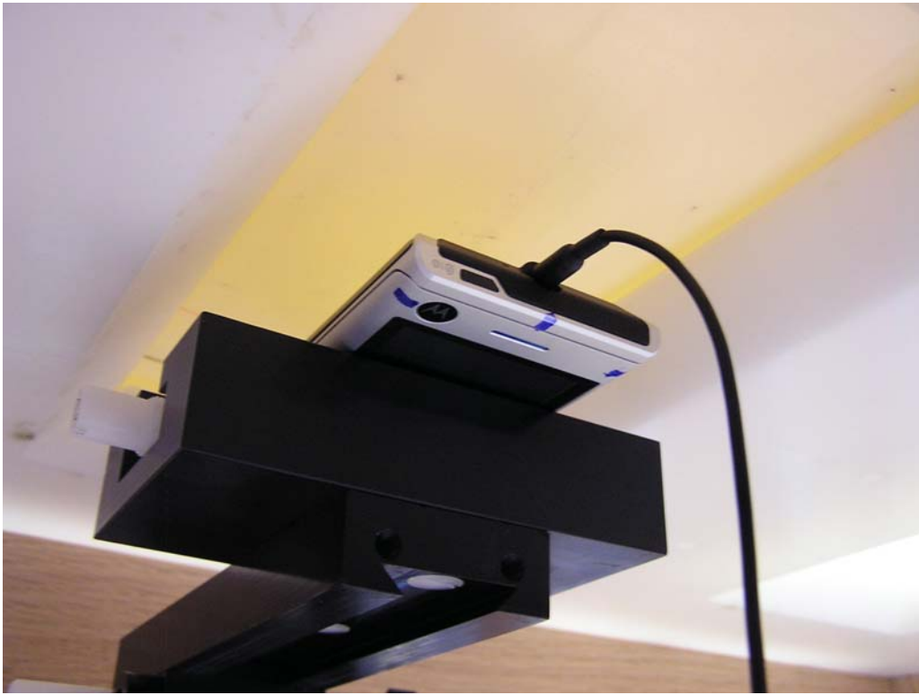
Figure 7: Body Position