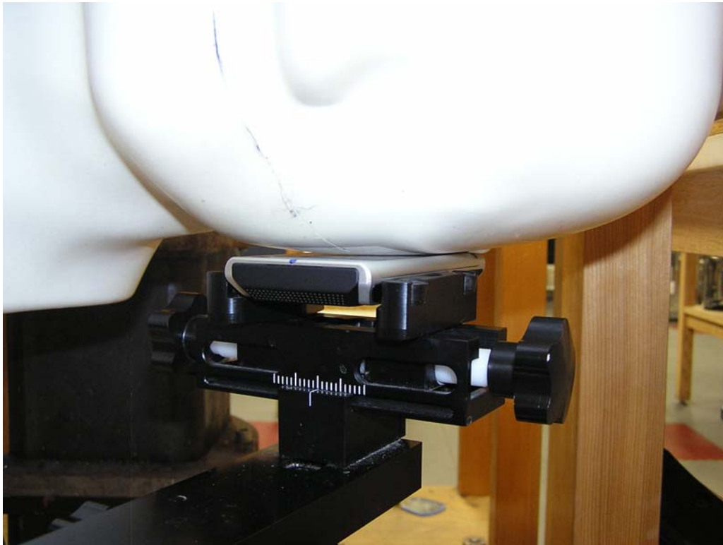
Figure 3: Cheek Position, Front of SAM Phantom