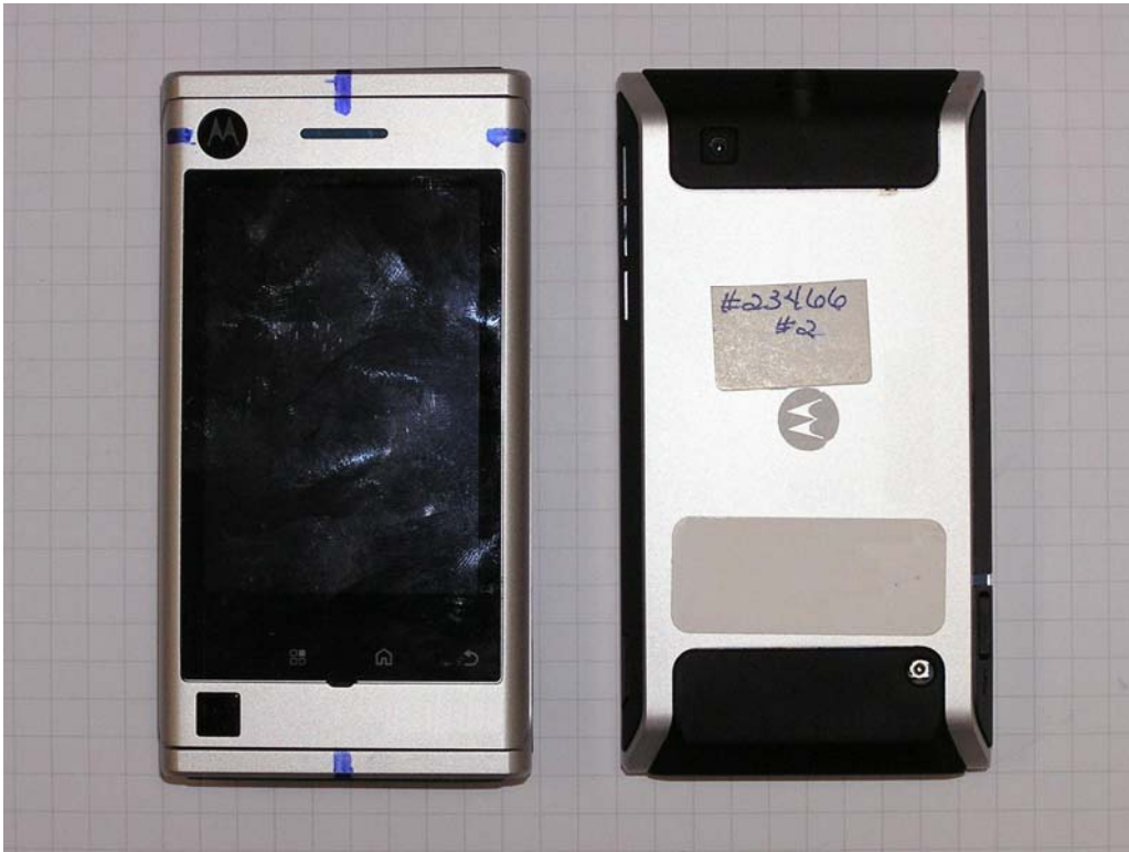
Figure 1: Phone Front and Back, Slider Retracted