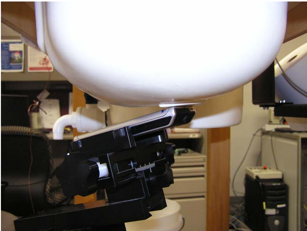
Figure 6: Tilt Position, Top of SAM Phantom