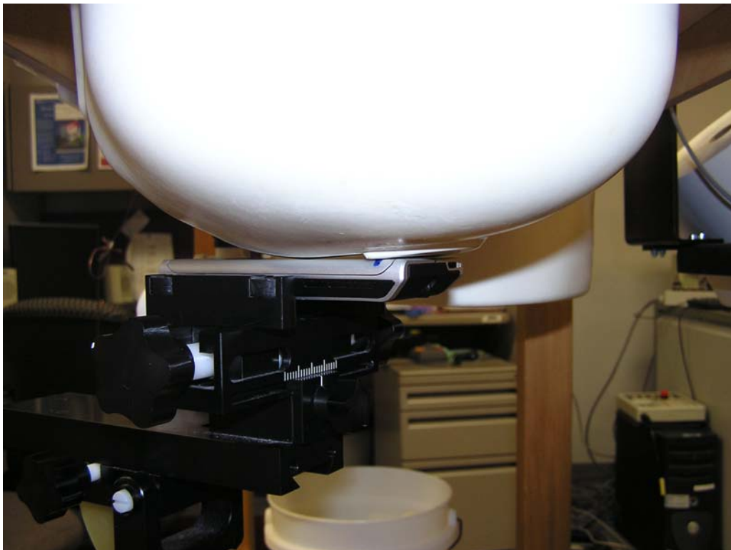
Figure 4: Cheek Position, Top of SAM Phantom