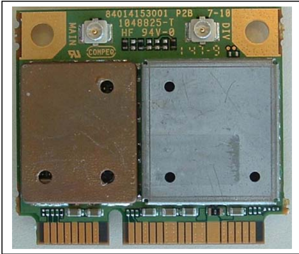
FRONT OF DATACARD

APPLICANT: MOTOROLA, INC. FCC ID: IHDP56KM1