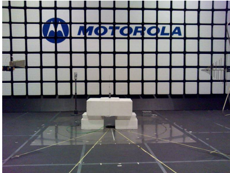
23101-1, IHDP56KH1 setup in semi-anechoic chamber – front view (30 MHz – 18 GHz)