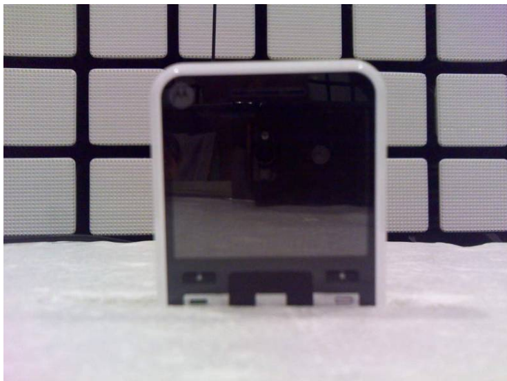
23101-1, IHDP56KH1 placed in test position Z – slider closed