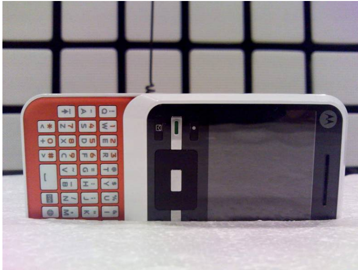
23101-1, IHDP56KH1 placed in test position Y – slider open