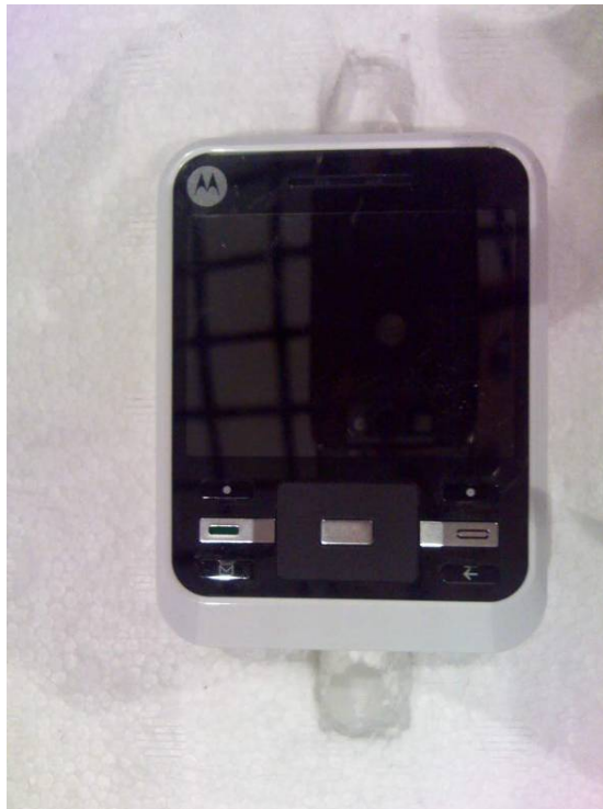
23101-1, IHDP56KH1 placed in test position X – slider closed