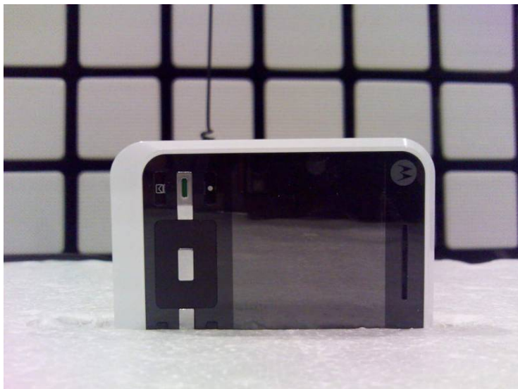
23101-1, IHDP56KH1 placed in test position Y – slider closed