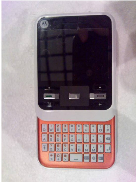
23101-1, IHDP56KH1 placed in test position X – slider open