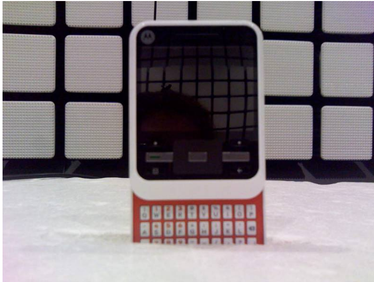
23101-1, IHDP56KH1 placed in test position Z – slider open