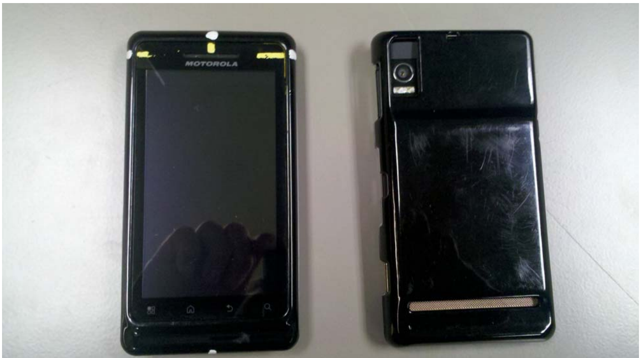
Figure 2: Phone Front and Back with Carry Accessory Mounted