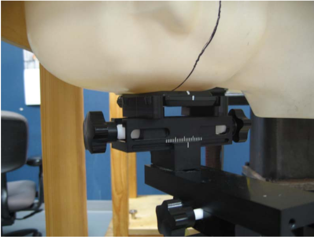
Figure 3: Cheek Position