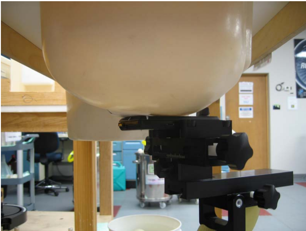
Figure 4: Cheek Position