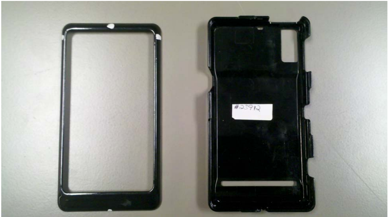
Figure 1: Carry Accessory Front and Back