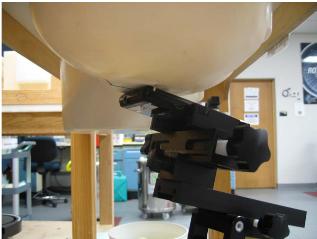
Figure 6: Tilt Position