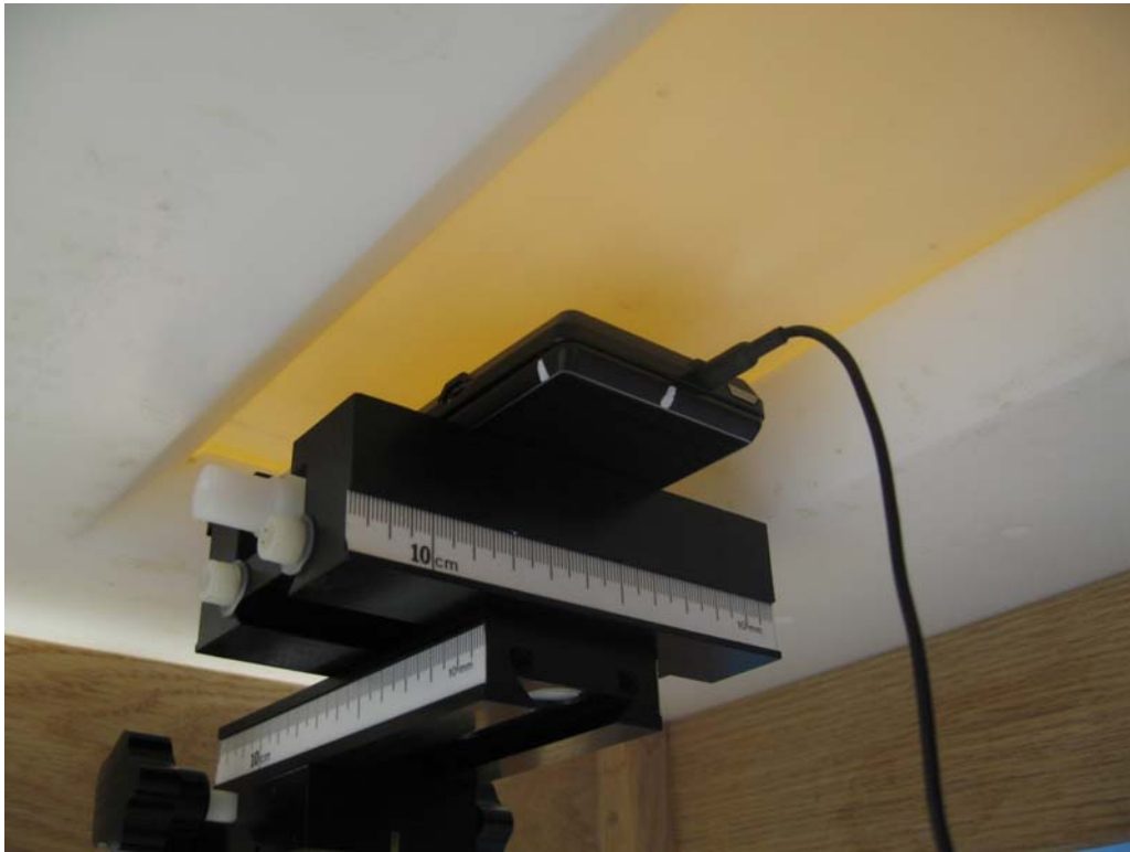
Figure 7: Body Position