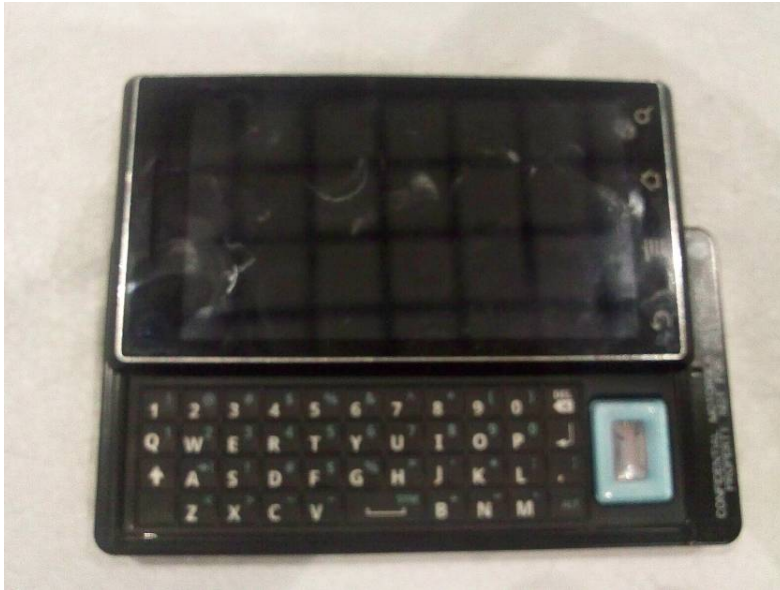
23164-1, IHDP56KC1 placed in test position X – slider open