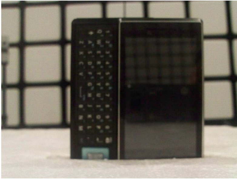
23164-1, IHDP56KC1 placed in test position Z – slider open