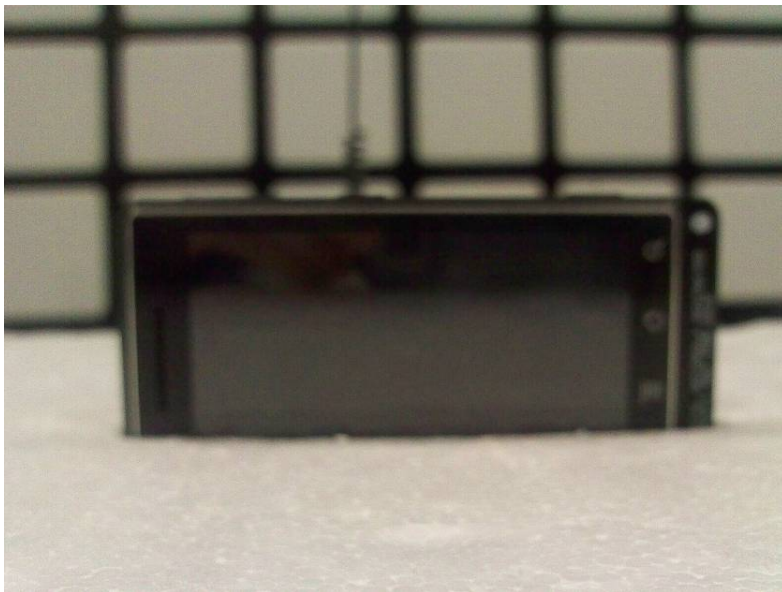
23164-1, IHDP56KC1 placed in test position Y – slider closed