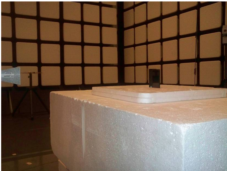
23164-1, IHDP56KC1 setup in semi-anechoic chamber – right view (18 GHz – 26.5 GHz)