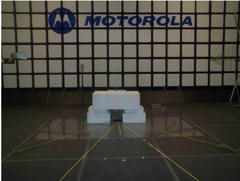
23164-1, IHDP56KC1 setup in semi-anechoic chamber – front view (30 MHz – 18 GHz)