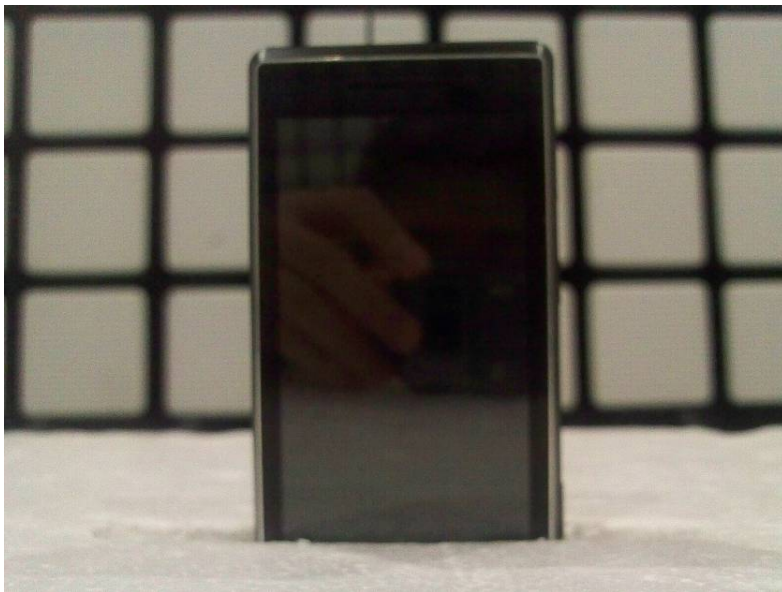
23164-1, IHDP56KC1 placed in test position Z – slider closed