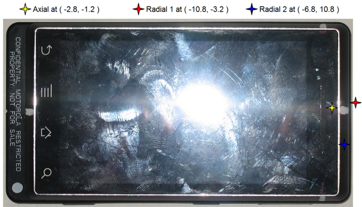
Figure 3. Phone Front - Location of Measured Points for Telecoil Emissions Testing