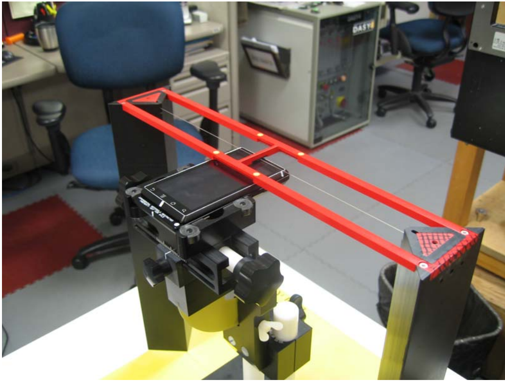
Figure 4. Positioning and Measurement for RF Emissions