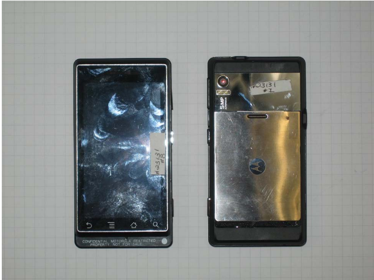
Figure 1. Phone Front and Back