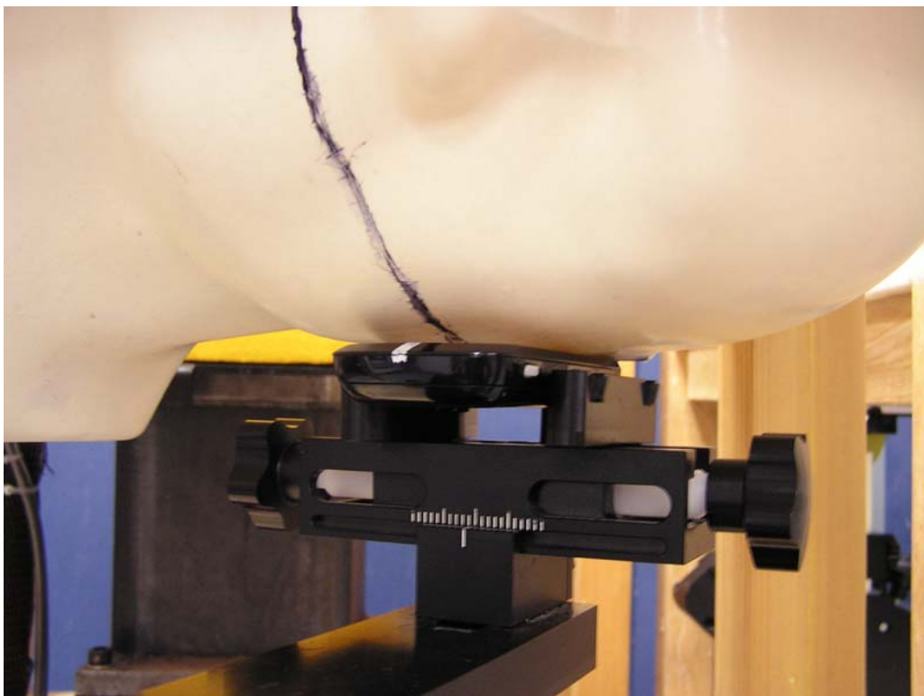
Figure 3: Cheek-touch Position