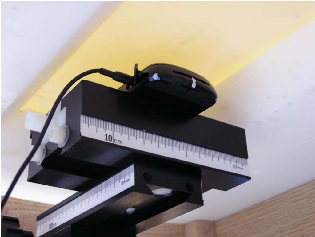
Figure 6: Body-Worn Position, 15 mm Separation from Phantom