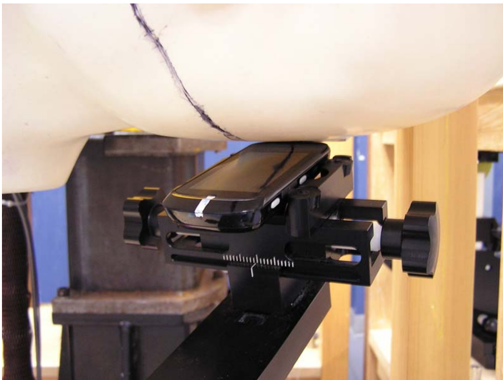
Figure 5: 15° Tilt Position