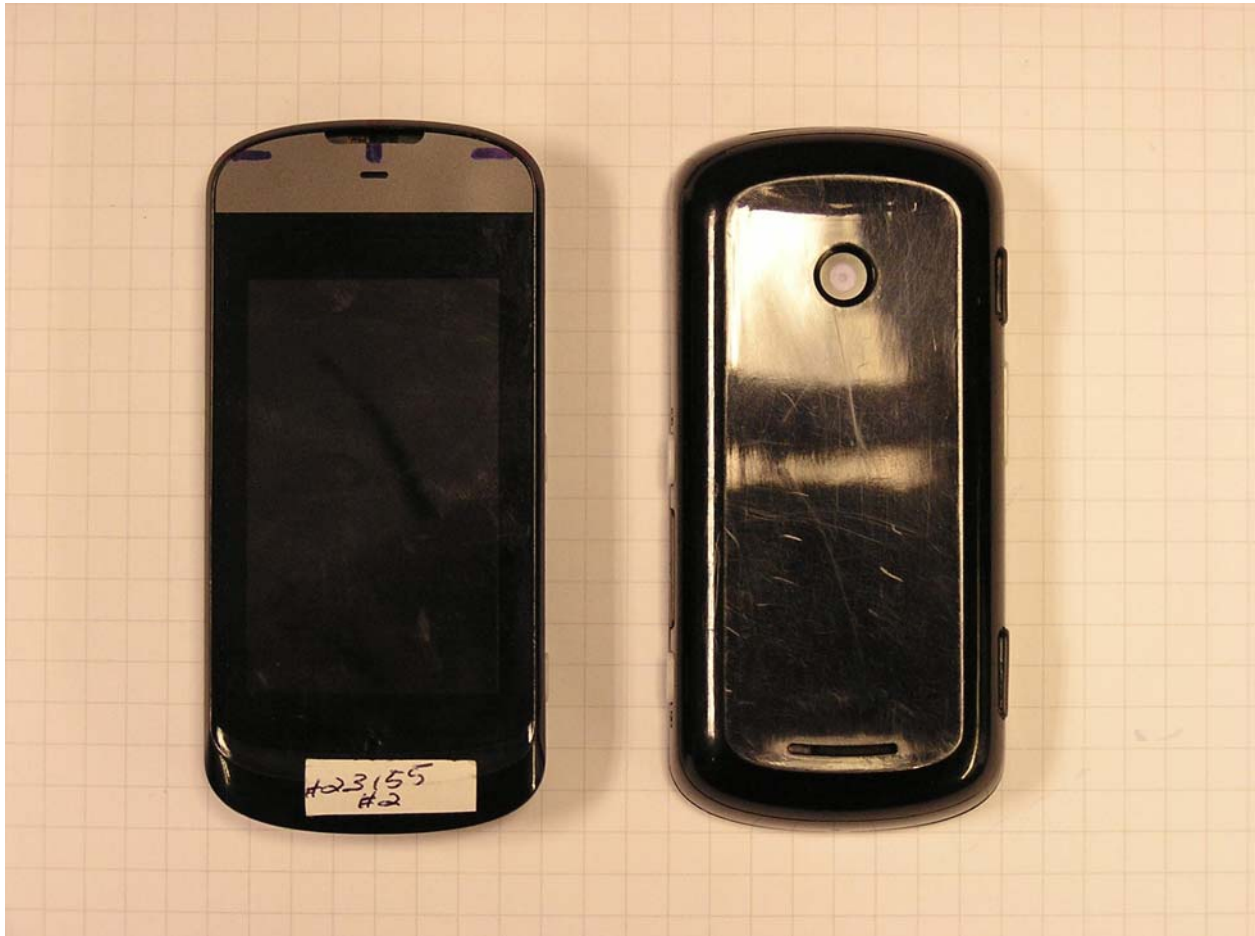
Figure 1: Phone Front and Back