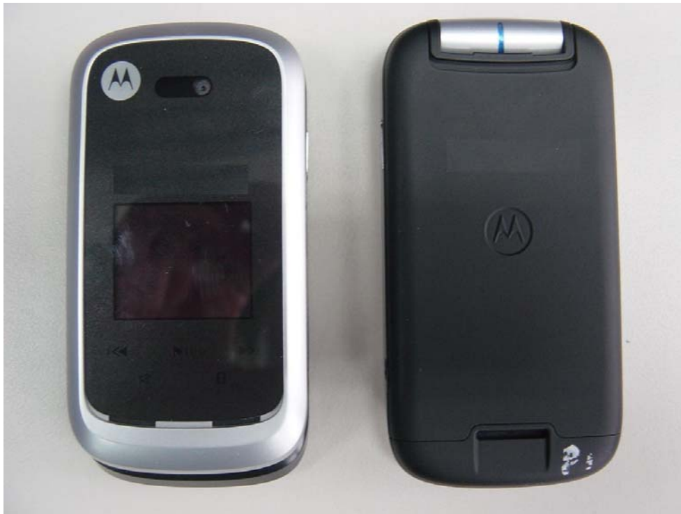
Figure 1: Front and Back of Phone (Flip closed)