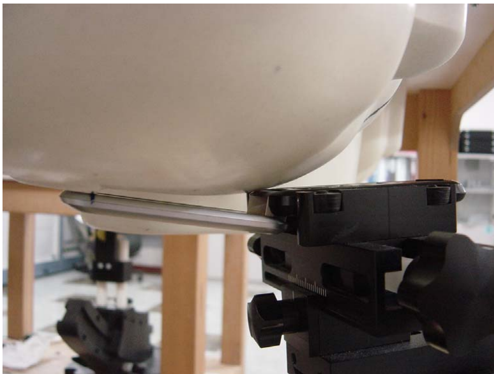
Figure 4: Phone Against the Head Phantom (Cheek Touch)