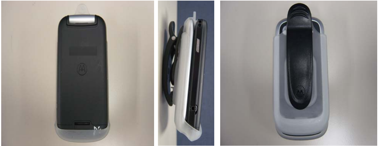
Figure 3: Phone with Plastic Clip SJYN0018A