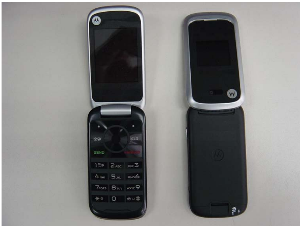
Figure 2: Front and Back of Phone (Flip opened)