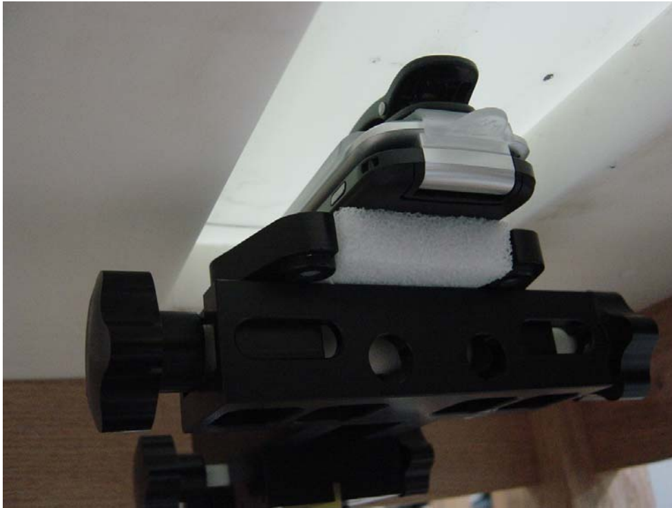
Figure 7: Phone Against the Flat Phantom with Plastic holster SJYN0018A