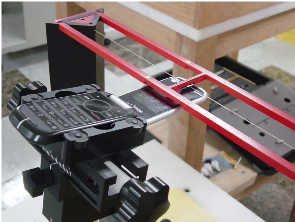
Figure 6. Positioning and Measurement for RF Emissions