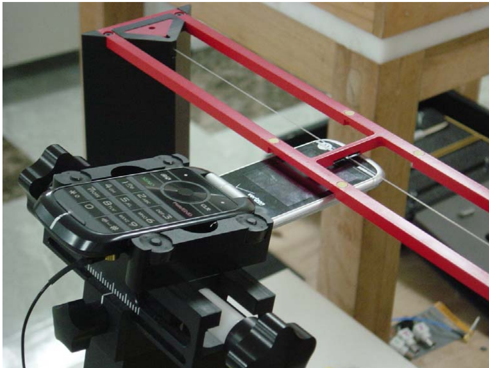
Figure 9. Positioning and Measurement for T-coil