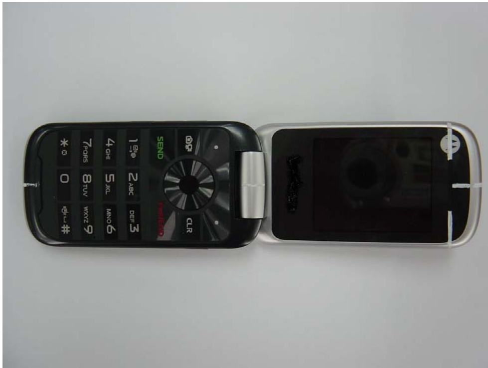
Figure 3. Phone Front - Open