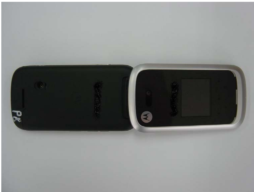
Figure 4. Phone Back - Open