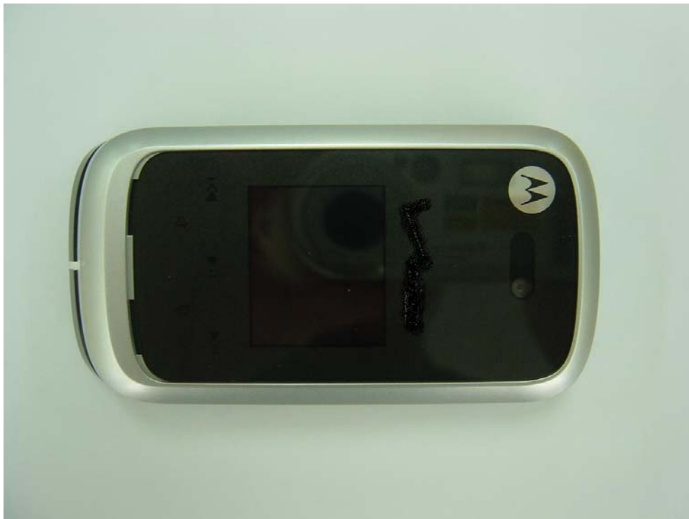
Figure 1. Phone Front - Closed