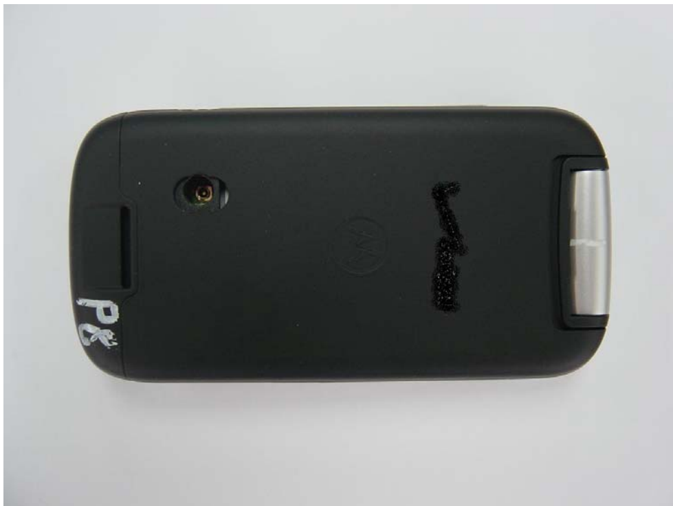
Figure 2. Phone Back - Closed