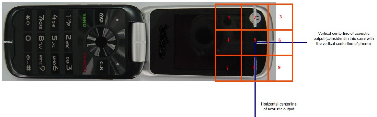
Figure 5. Phone Open - Orientation and Measurement Plane for RF Emissions Testing