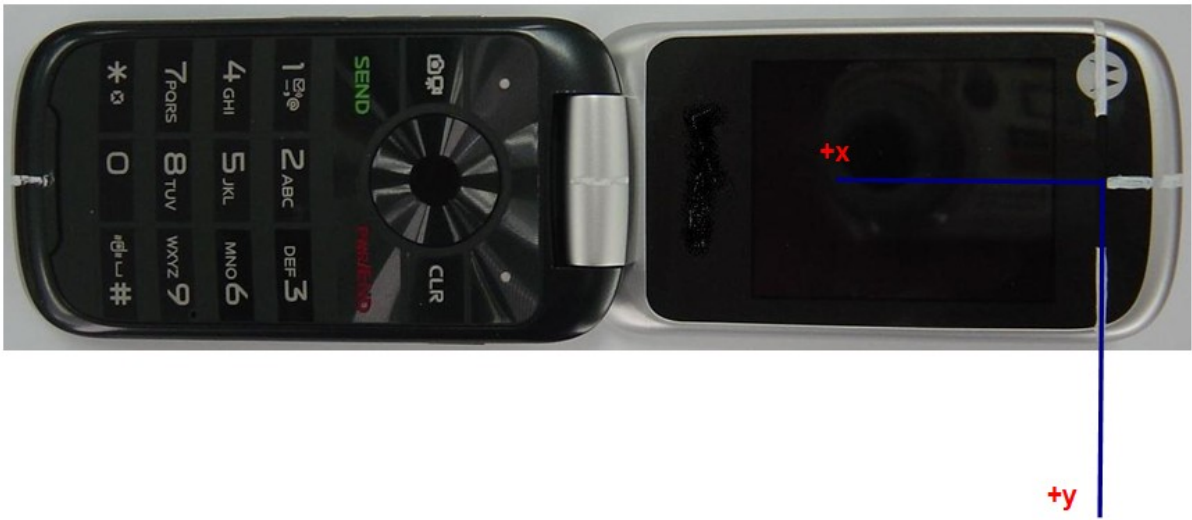
Figure 7. Coordinate Axis for T-coil Measurements