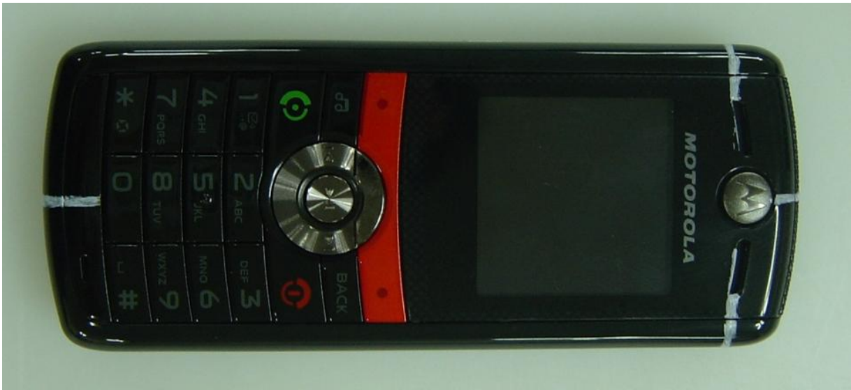
Figure 1. Phone Front