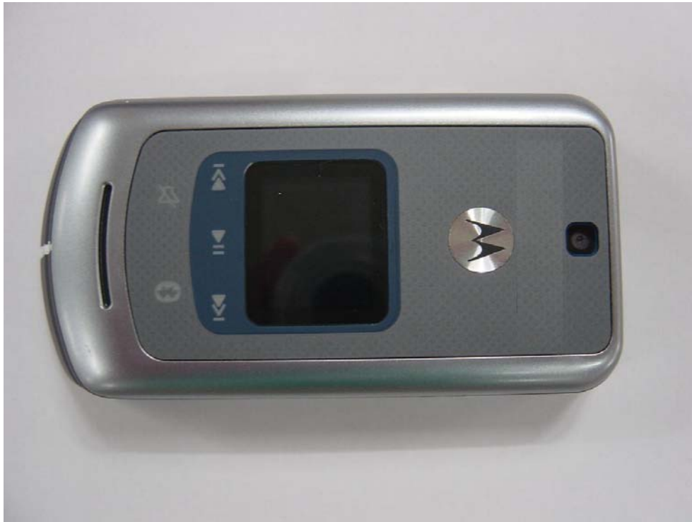
Figure 1. Phone Closed