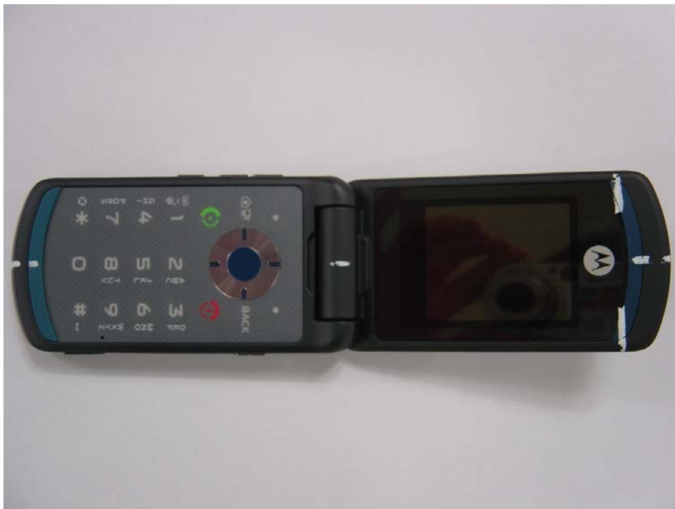
Figure 2. Phone Open