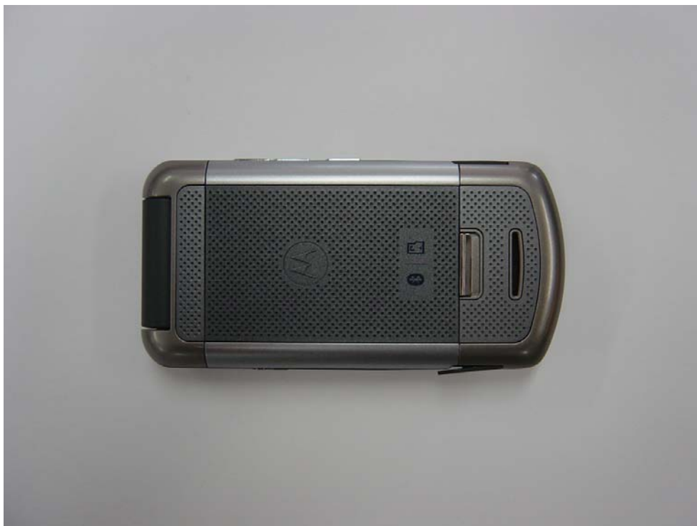
Figure 2: Back of Phone