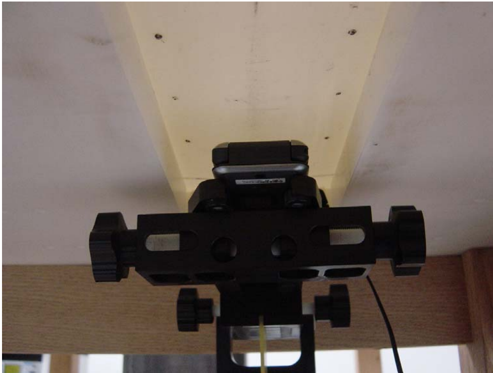
Figure 7: Phone Against the Flat Phantom