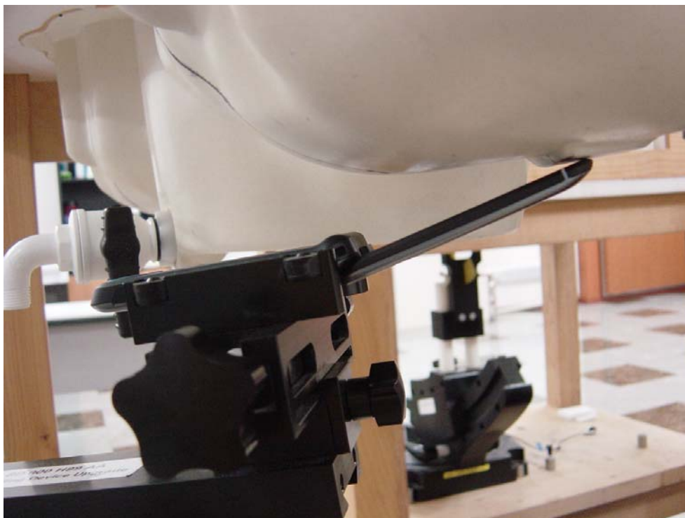
Figure 6: Phone Against the Head Phantom (15° Tilt)