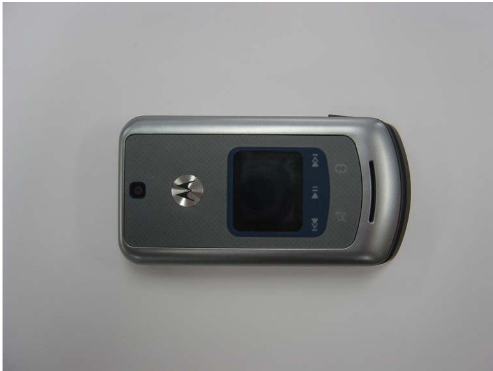
Figure 1: Front of Phone