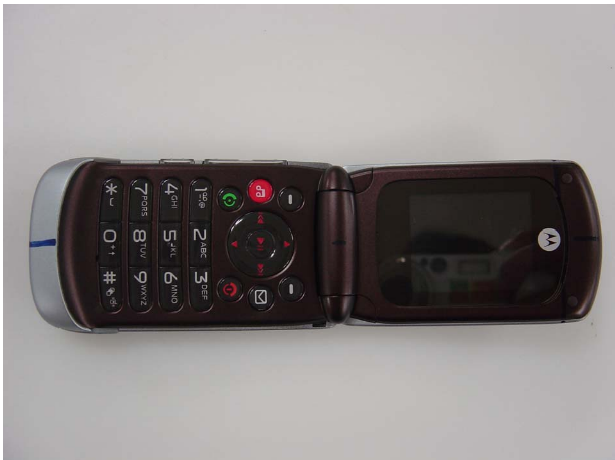
Figure 2. Phone Open