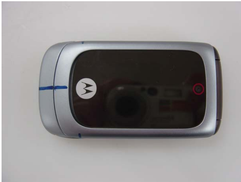
Figure 1. Phone Closed