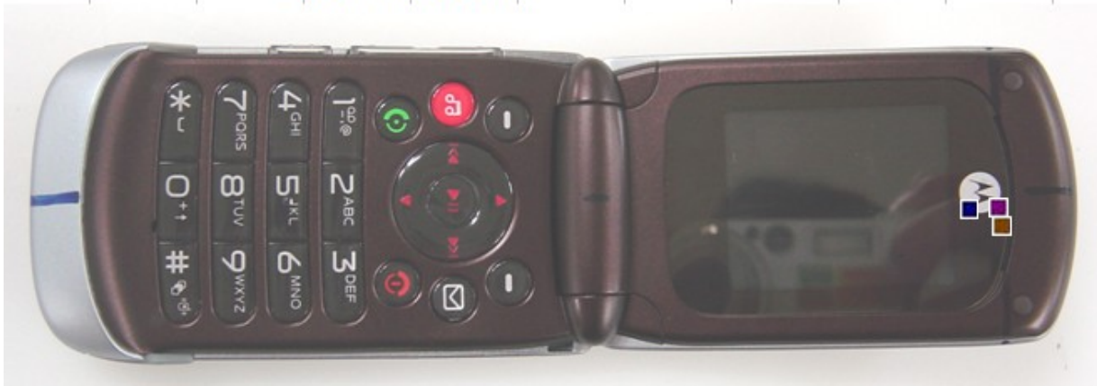
Figure 5. Location of Measured Points for T-coil measurements