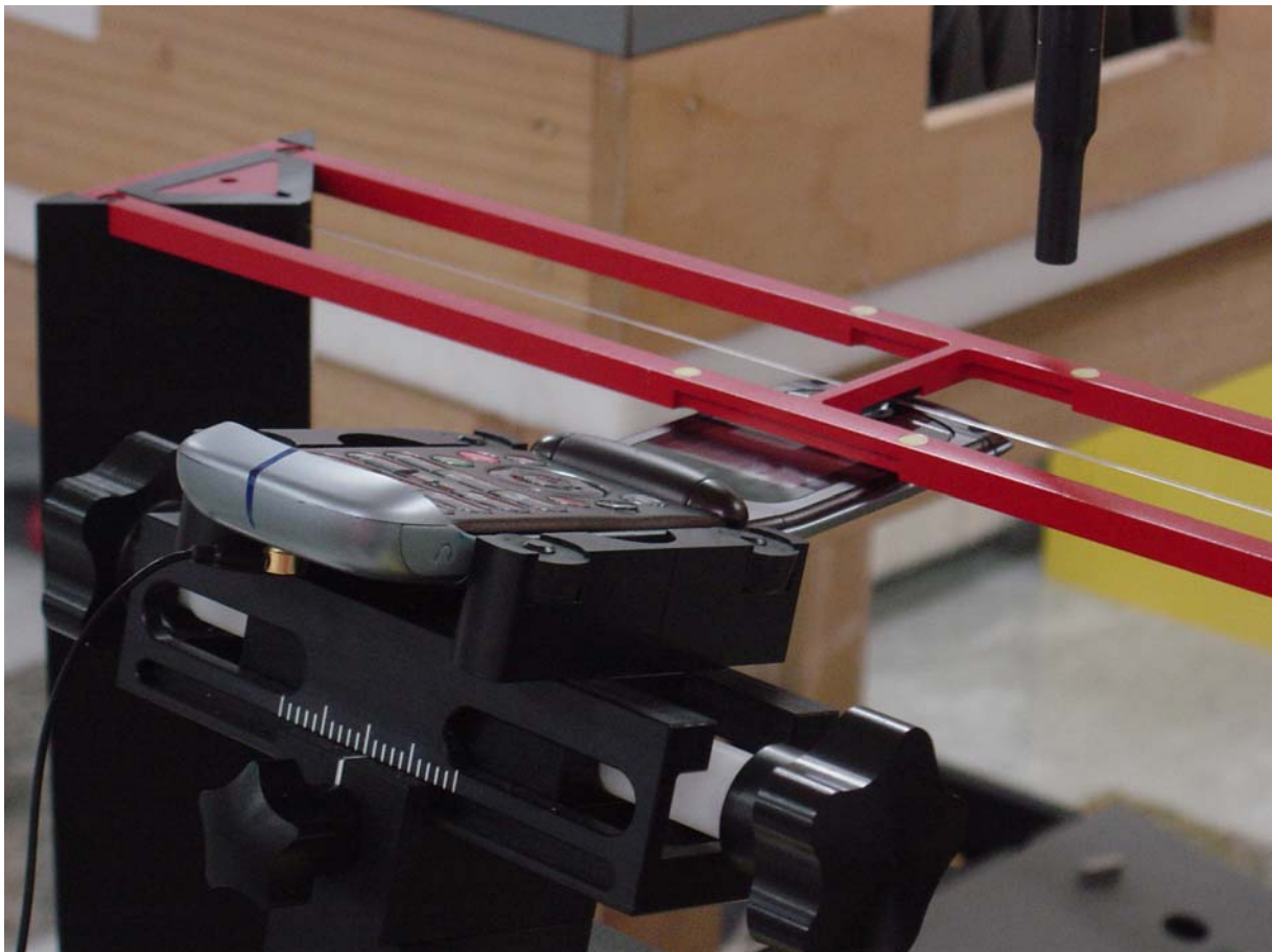
Figure 6. Positioning and Measurement for T-coil