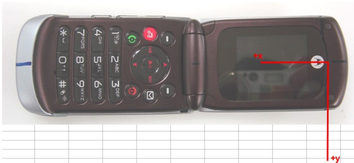
Figure 4. Coordinate Axis for T-coil Measurements