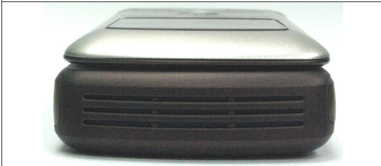
Figure 3-8. Opposite Side of radio