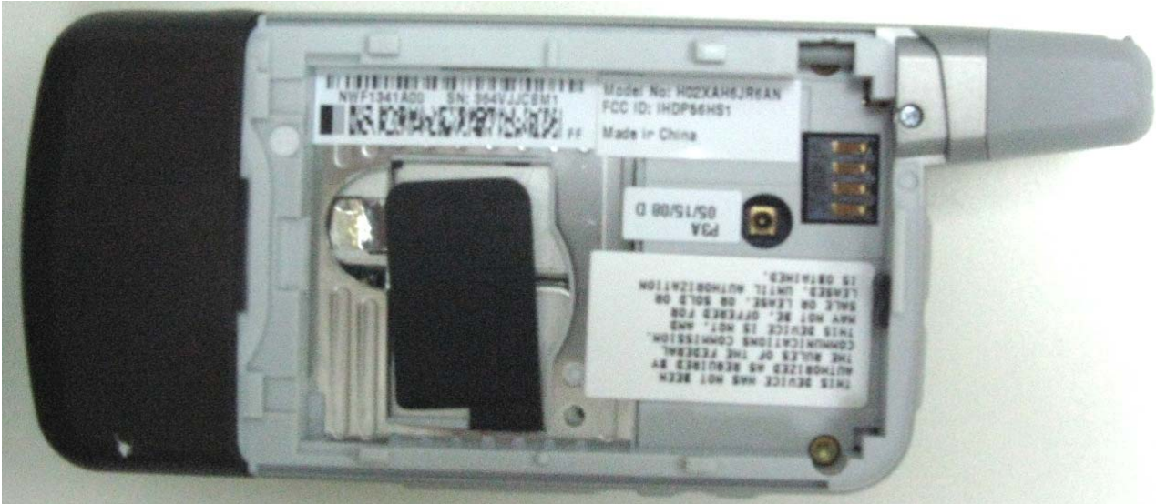
Figure 3-9. Interior Compartment of radio