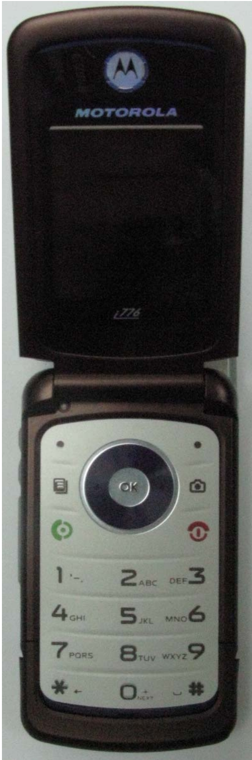
Figure 3-3. Front of radio (Flip Open)