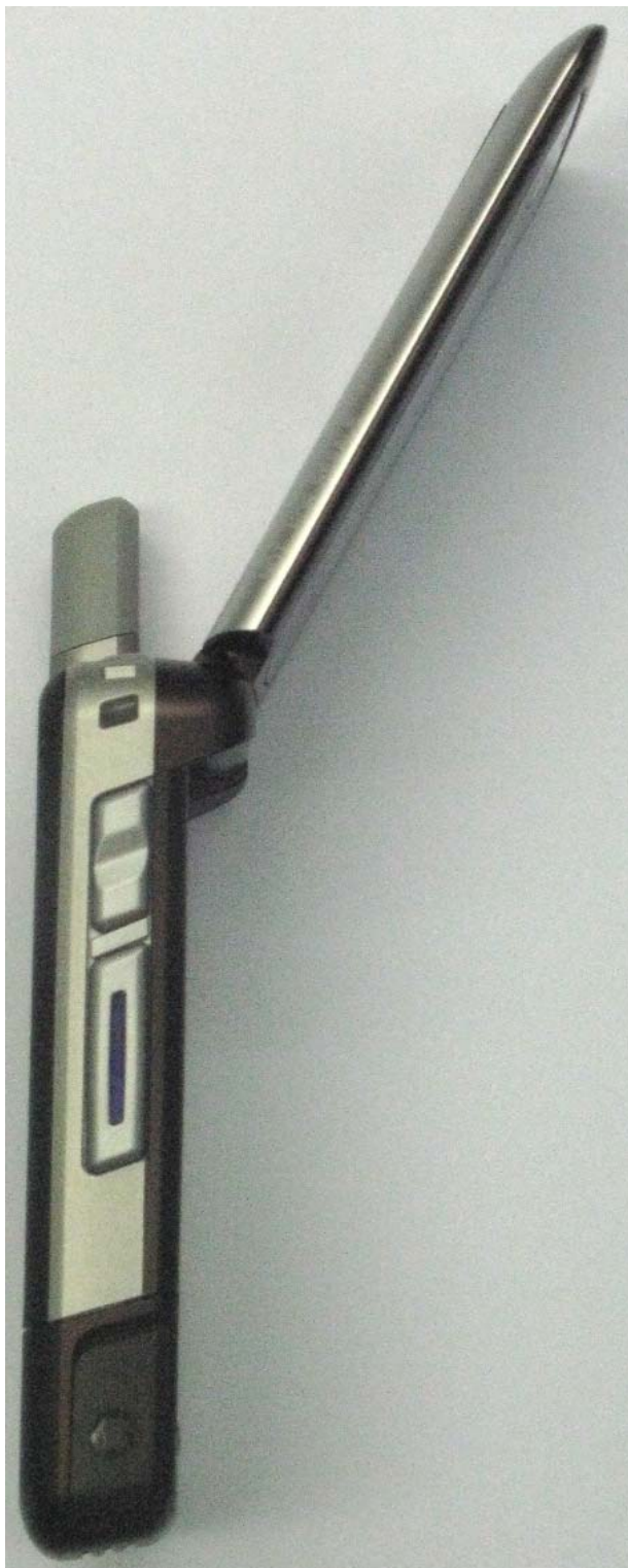
Figure 3-5. Button Side of radio