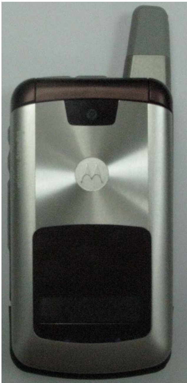
Figure 3-1. Front of radio

The radio product shapes, colors and housings/bezels may vary.