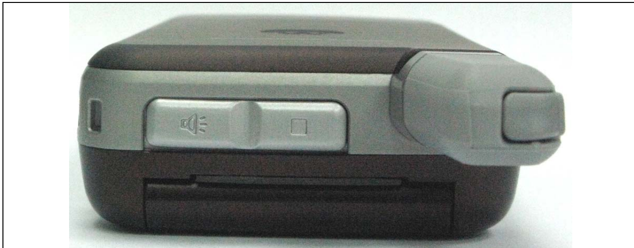
Figure 3-7. Button Side of radio