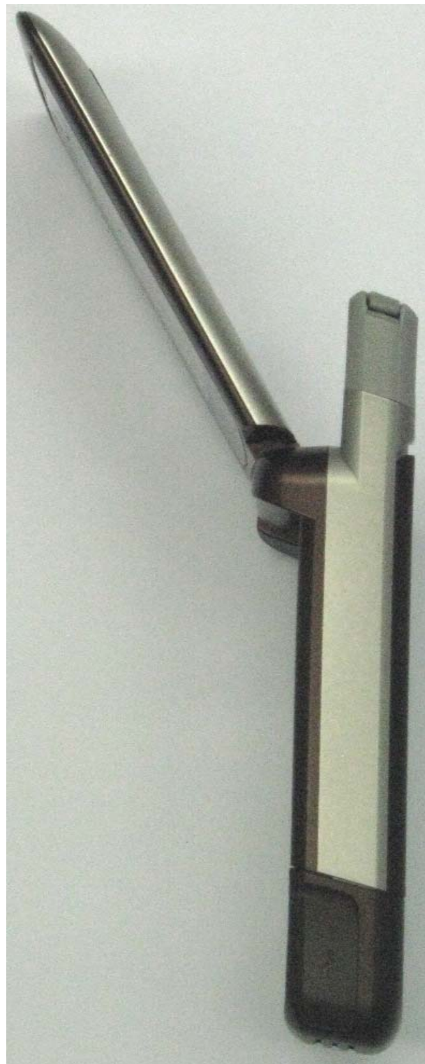
Figure 3-6. Opposite Side of radio