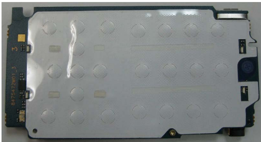
Photograph 9-3: Keypad side of radio product PC Board,.