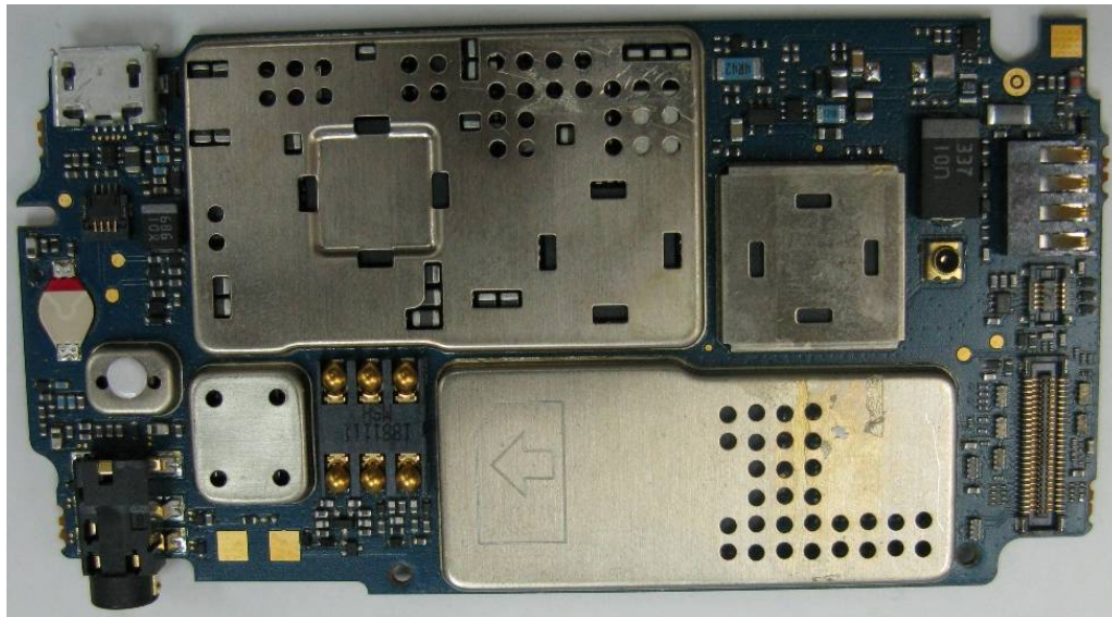
Photograph 9-1: Component side of radio product PC Board, Shields in place.