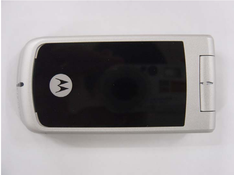
Figure 1. Phone Closed