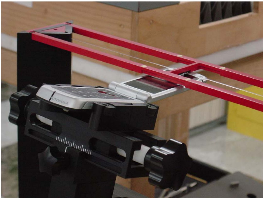
Figure 4. Positioning for RF Emissions