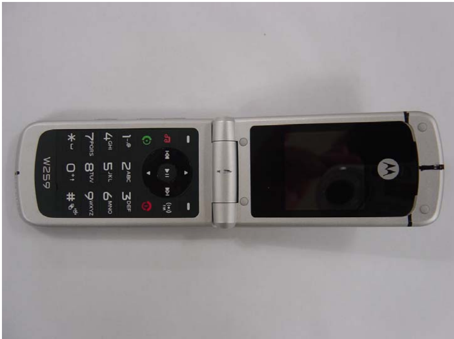
Figure 2. Phone Open