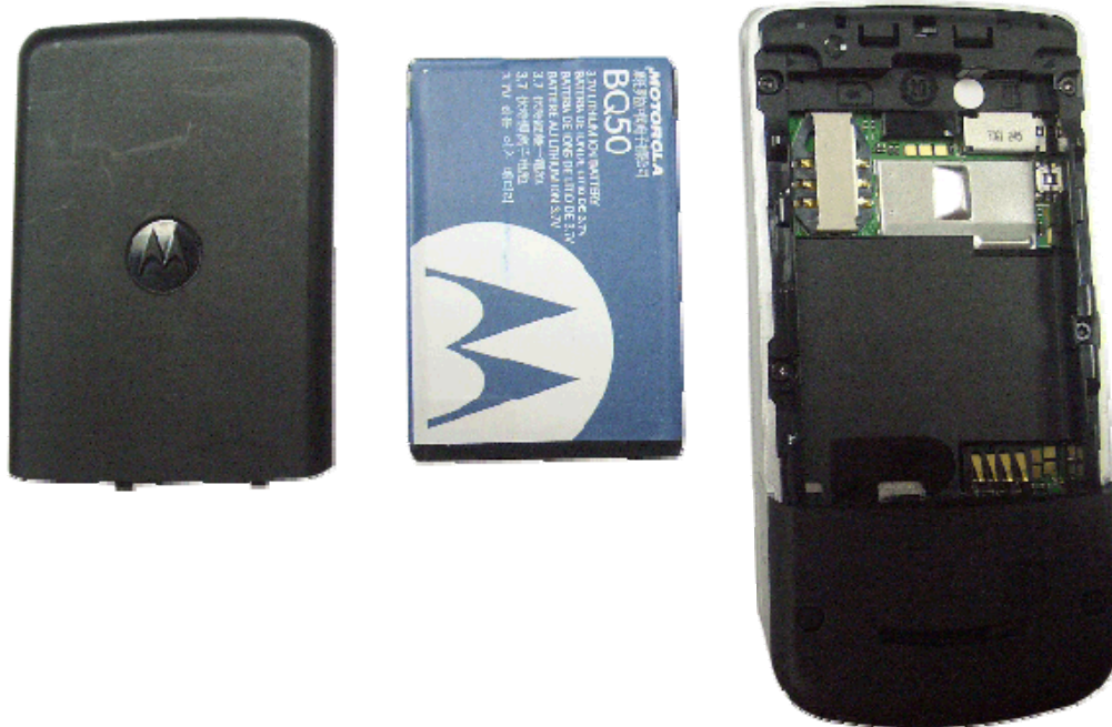
Back view with FCC label