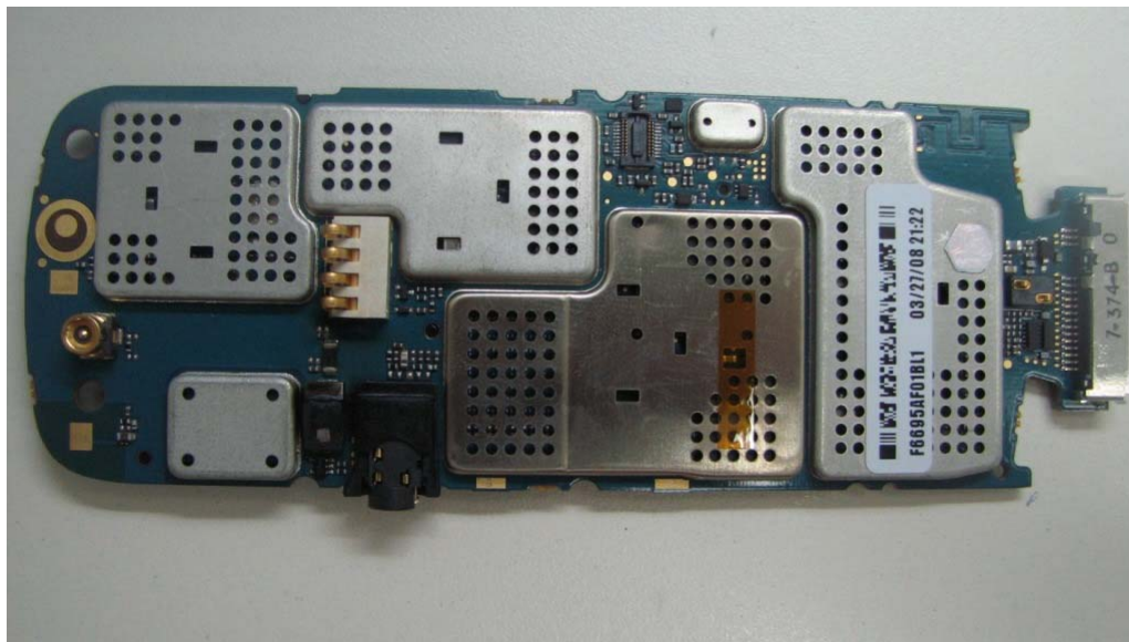
Photograph 9-1: Back side view of radio product PC Board with Shields in place.