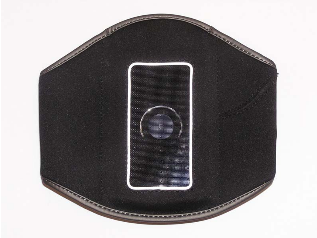
Figure 3 – Armband SYN2419A (Phone inserted)