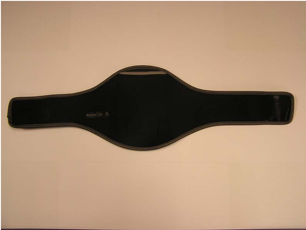
Figure 2 – Armband SYN2419A (body-side)