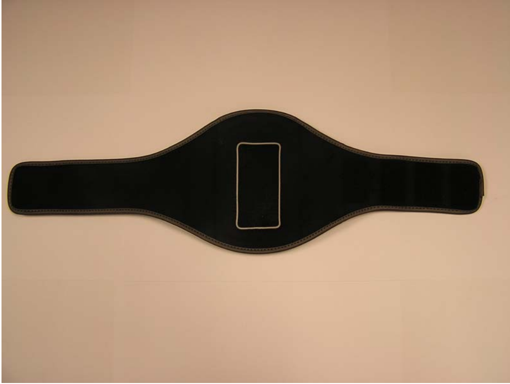
Figure 1 – Armband SYN2419A