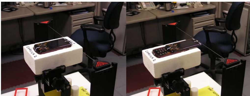
Figure 5. Measurement for RF Emissions, Slider Retracted (left) and Extended (right)