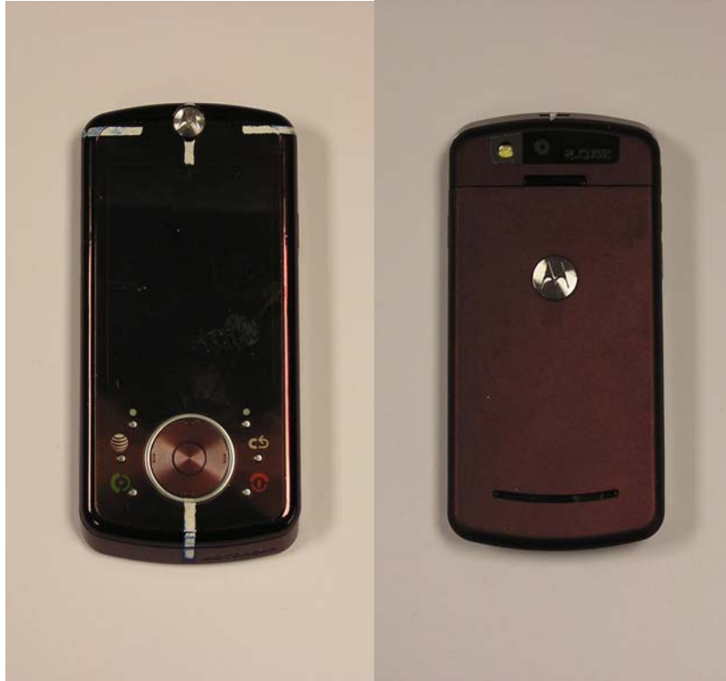
Figure 1. Phone Front and Back, Slider Retracted