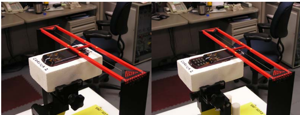
Figure 4. Positioning for RF Emissions, Slider Retracted (left) and Extended (right)