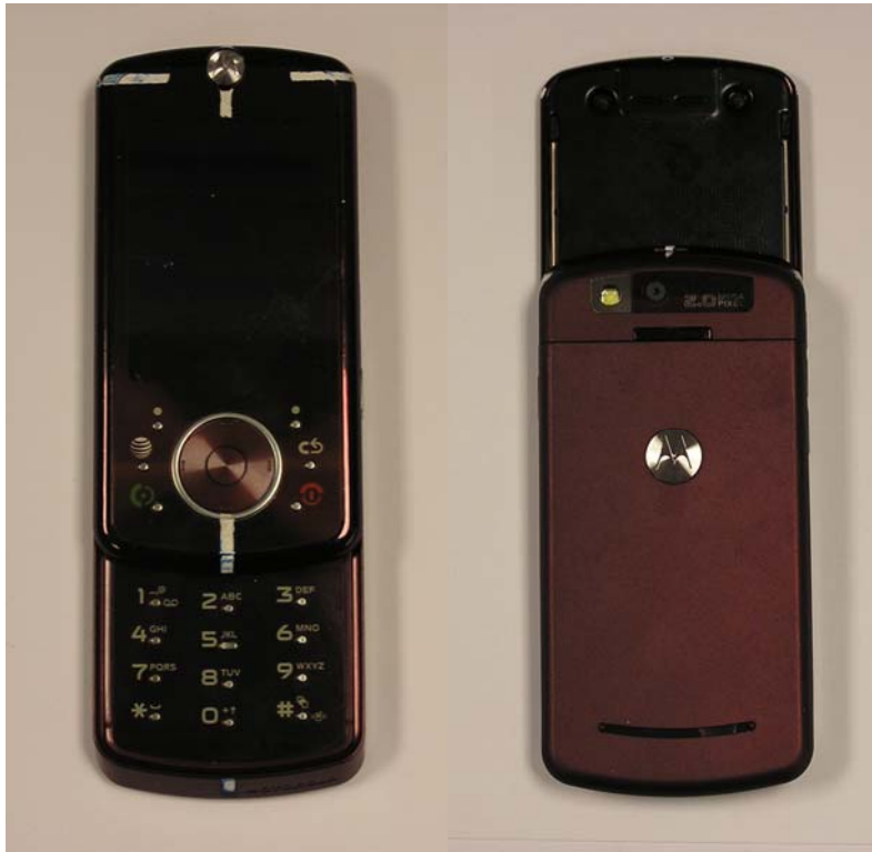
Figure 2. Phone Front and Back, Slider Extended