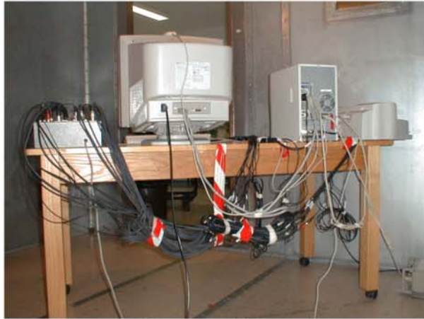
Rear view of the setup