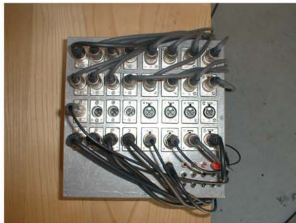
Detail view of the load box