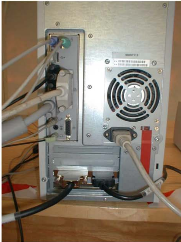
Detailed view of PC with Analog and Digital cables (Black)