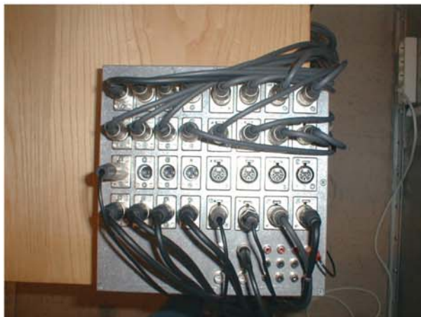
Detailed view of the load box