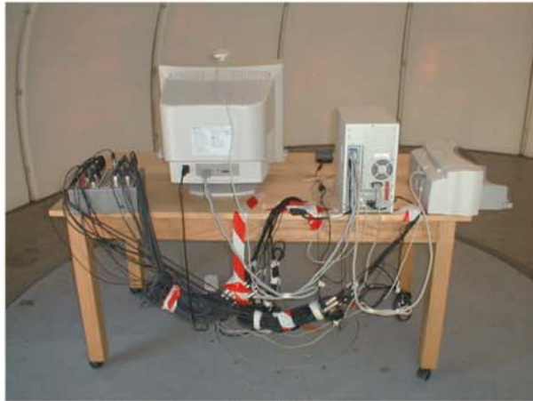
Rear view of the setup