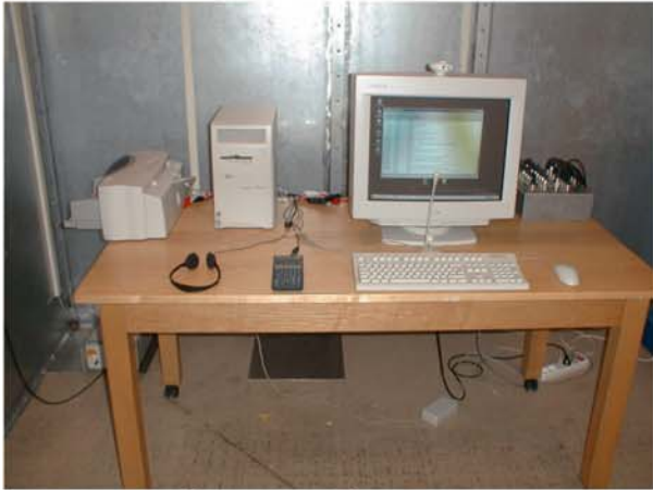
Front view of the setup