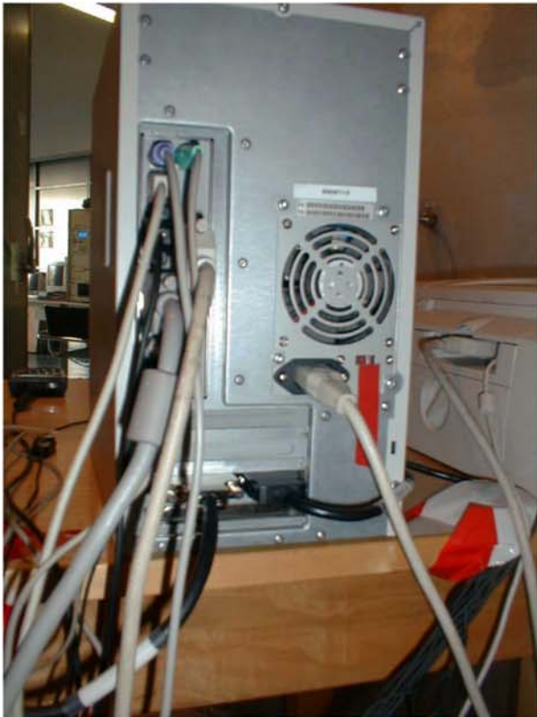
Detailed view of PC with Analog and Digital cables (Black)