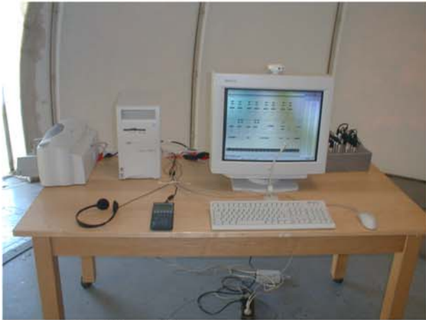
Front View of the setup