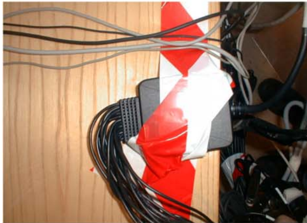
Breakout cable (analog)