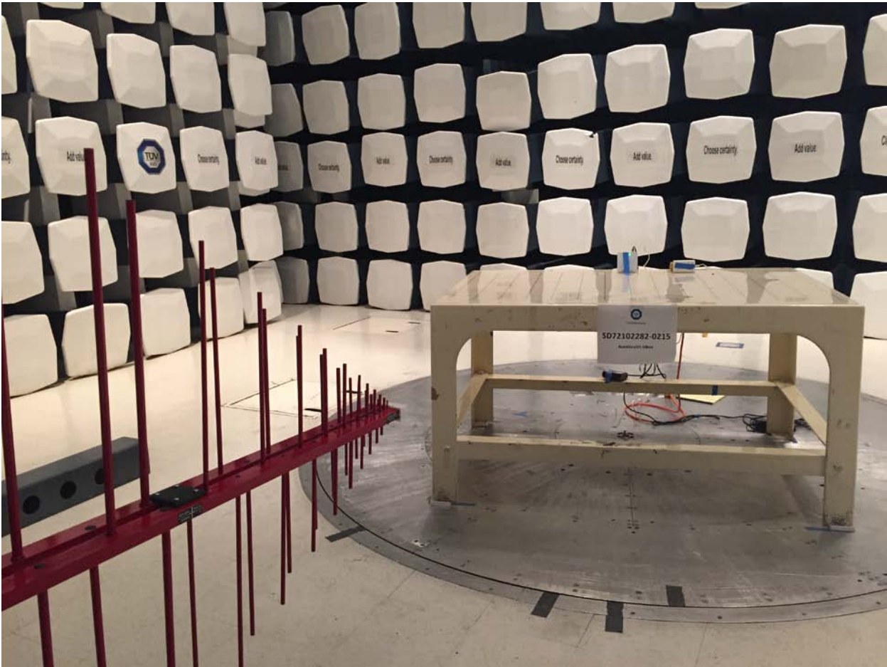
Radiated Emissions Test Setup (below 1GHz)