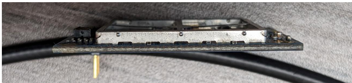
Figure 3 XPD2400 board's side view with shield lid removed.