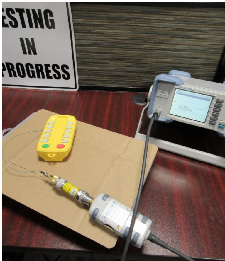
Figure 4: Max Peak Conducted Output Power Measurements