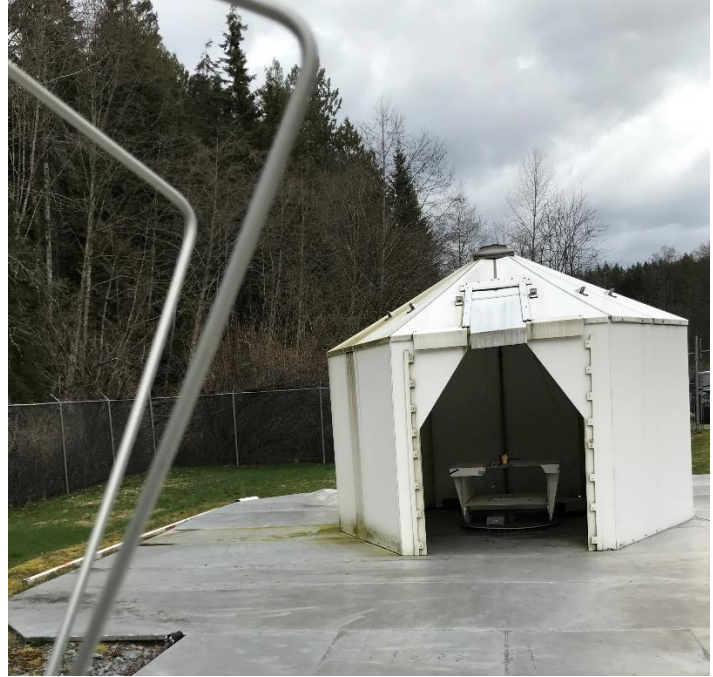
Figure 3: Radiated Emissions 30 MHz – 1 GHz - OATS