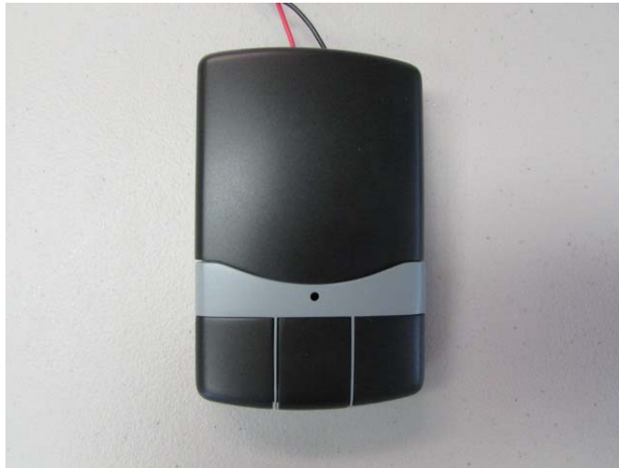
Figure 1: Front