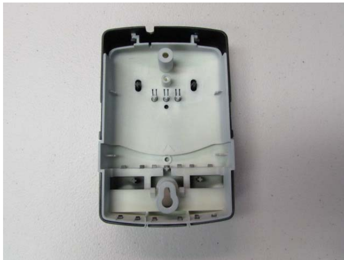
Figure 2: Back without PCB