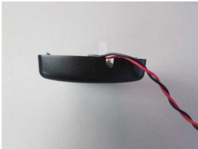
Figure 4: Top