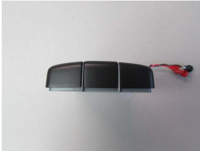
Figure 5: Bottom