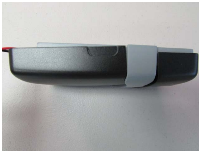
Figure 7: Left Side