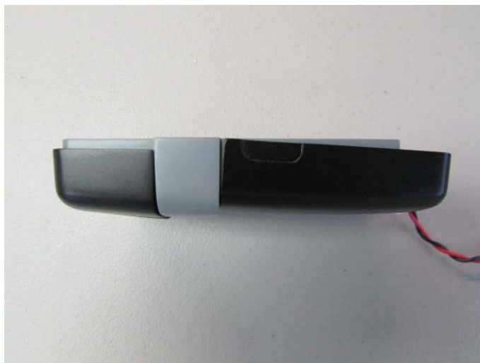
Figure 6: Right Side