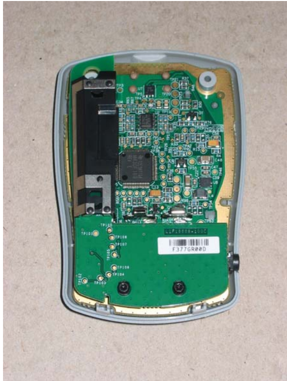
PCB assemblies in front housing