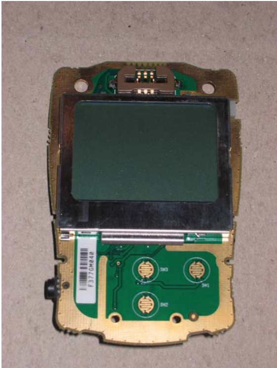
Main Board LCD side