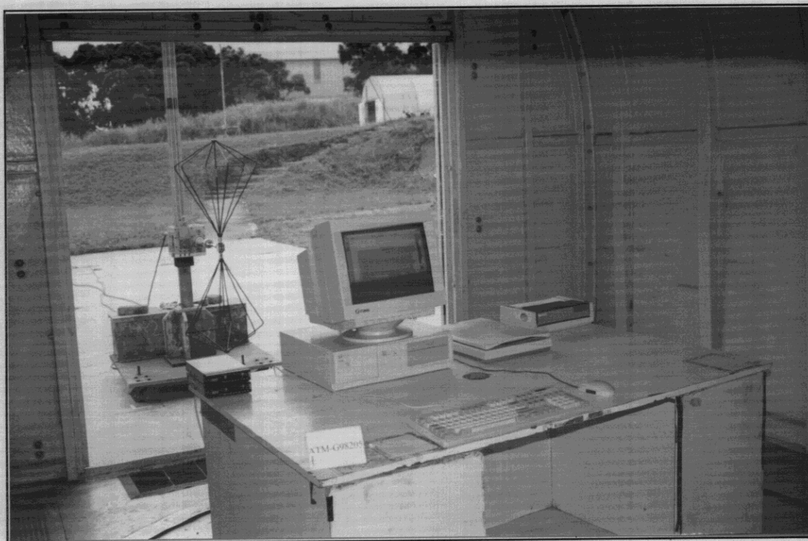
FRONT VIEW OF RADIATED TEST