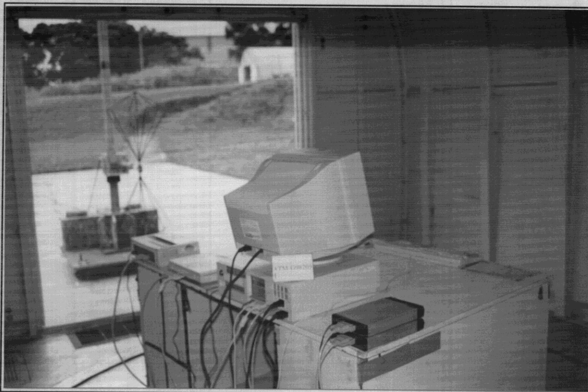
SETUP WITH MAXIMUM DETECTED EMISSION AT VERTICAL POLARIZATION