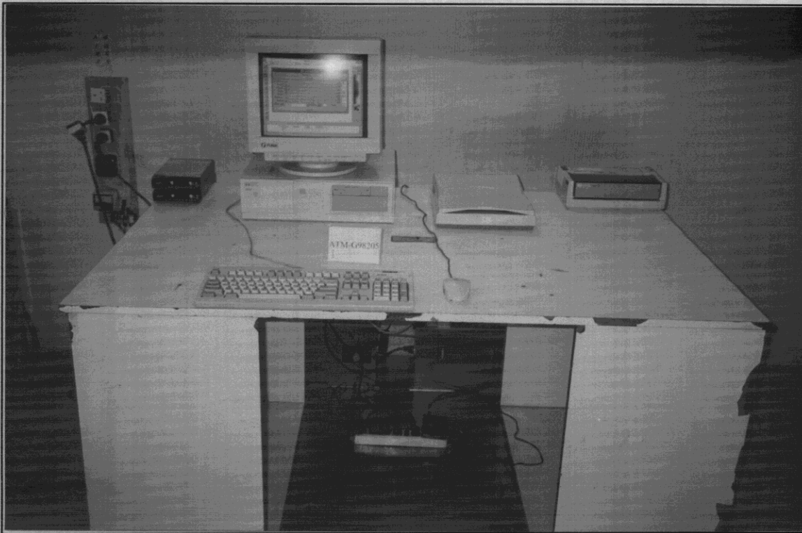
FRONT VIEW OF CONDUCTED TEST