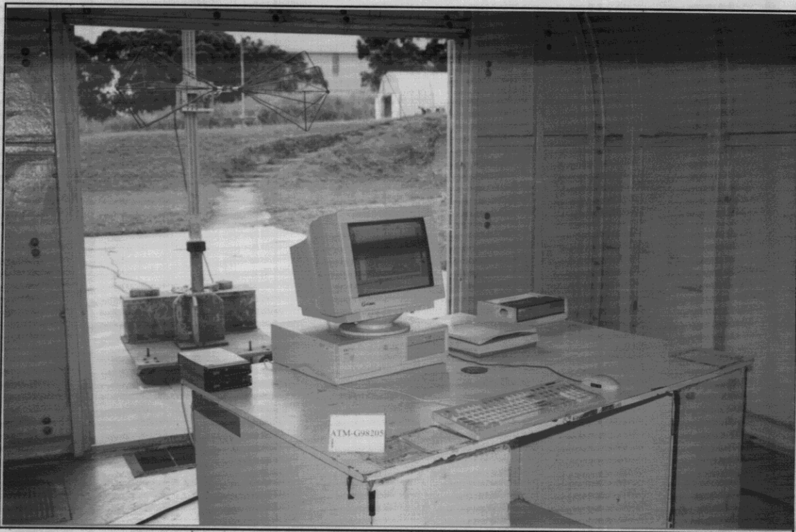
SETUP WITH MAXIMUM DETECTED EMISSION AT HORIZONTAL POLARIZATION