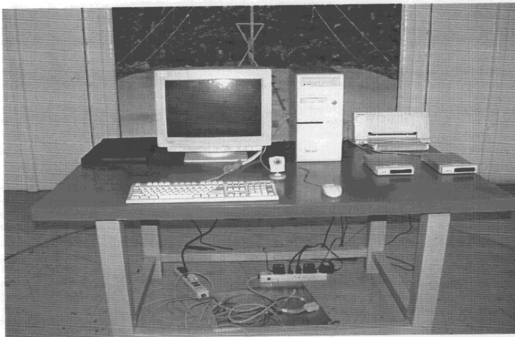
Mode 1 : Back View of Radiated Test (Maximum Testing Configuration)