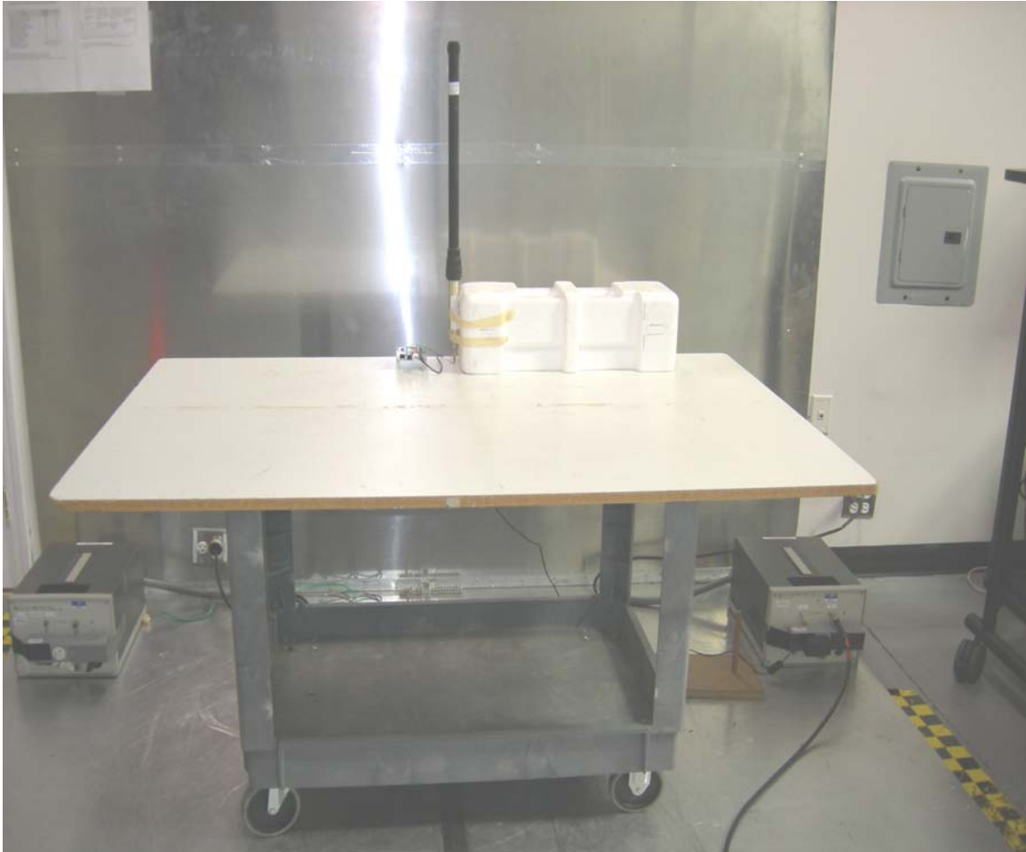
Figure 5: Conducted Emissions – View 1: 9dBi Dipole Antenna