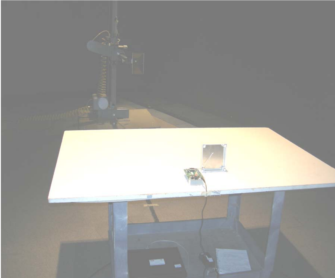
Figure 4: Radiated Emissions – View 2: 12dBi Patch Antenna