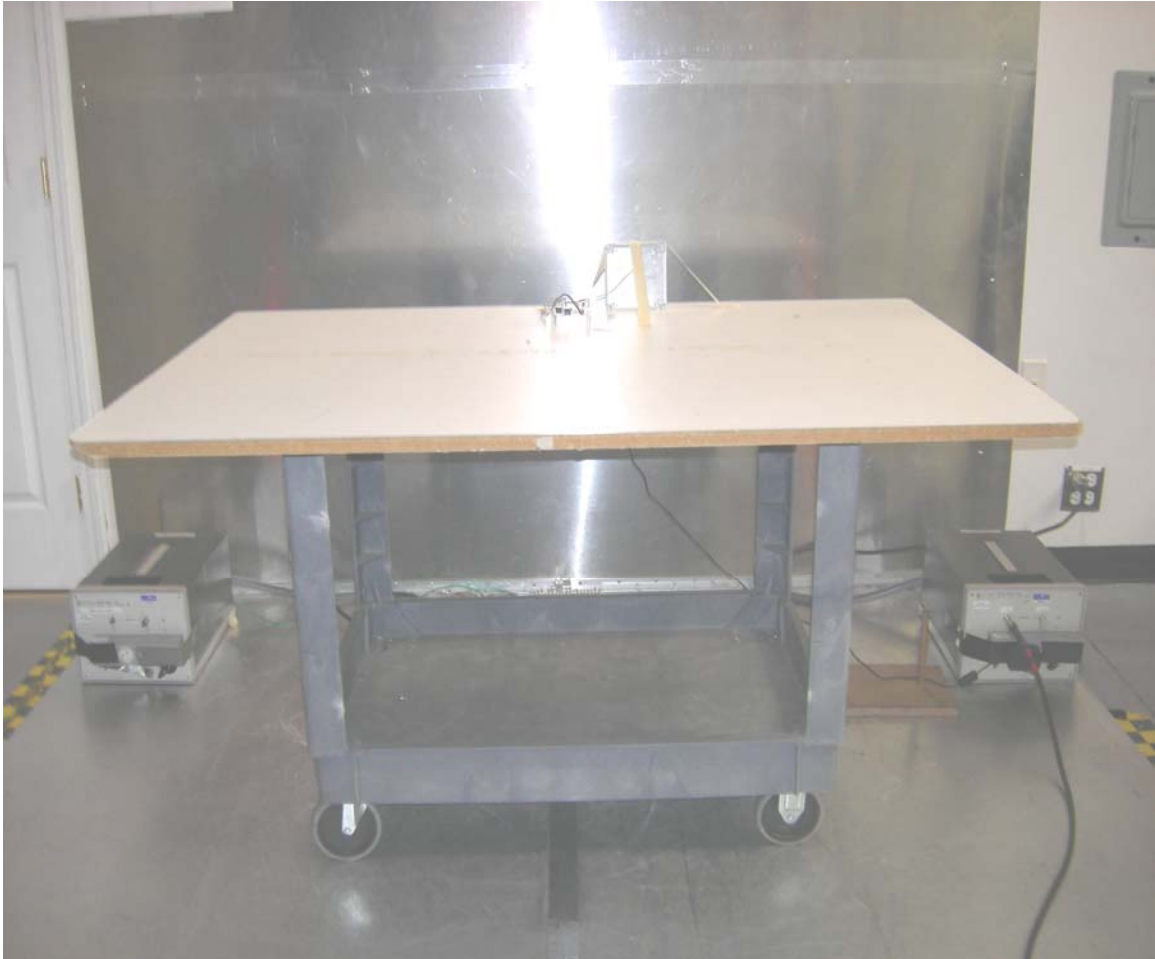
Figure 8: Conducted Emissions – View 1: 12dBi Patch Antenna