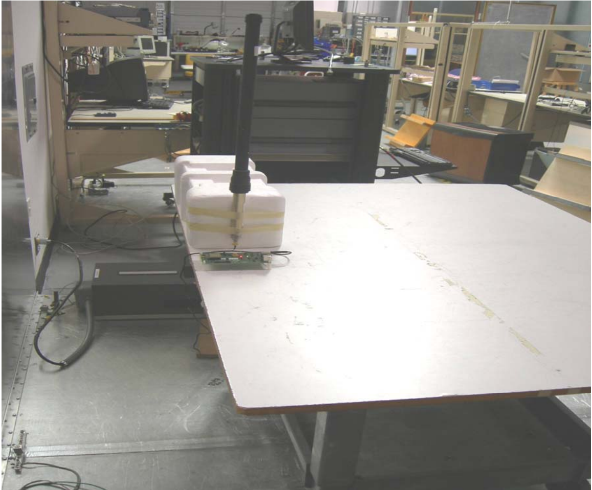
Figure 6: Conducted Emissions – View 2: 9dBi Dipole Antenna