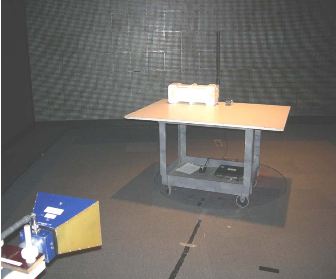
Figure 1: Radiated Emissions – View 1: 9dBi Dipole Antenna