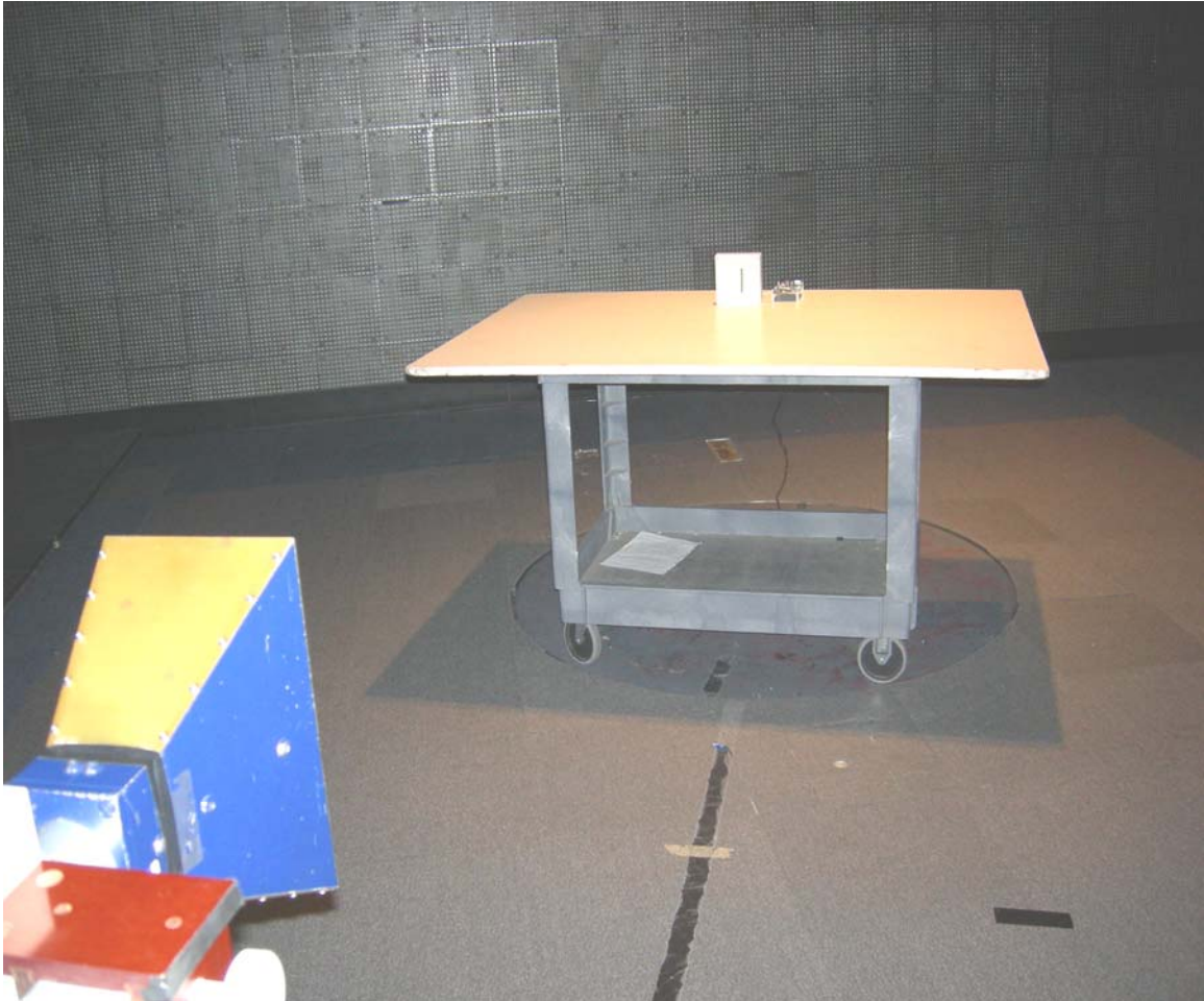
Figure 3: Radiated Emissions – View 1: 12dBi Patch Antenna