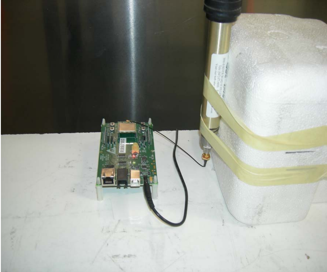
Figure 7: Conducted Emissions – View 3: 9dBi Dipole Antenna