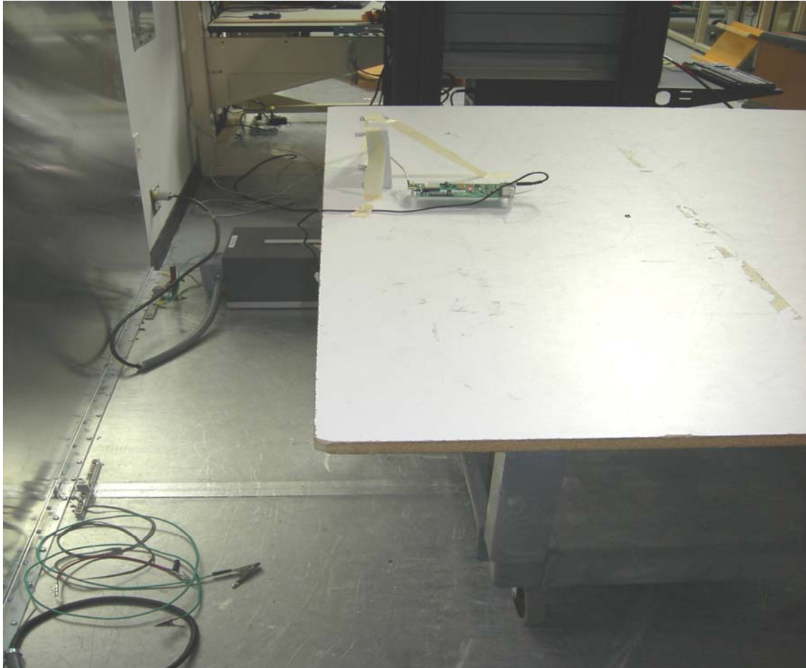
Figure 9: Conducted Emissions – View 2: 12dBi Patch Antenna