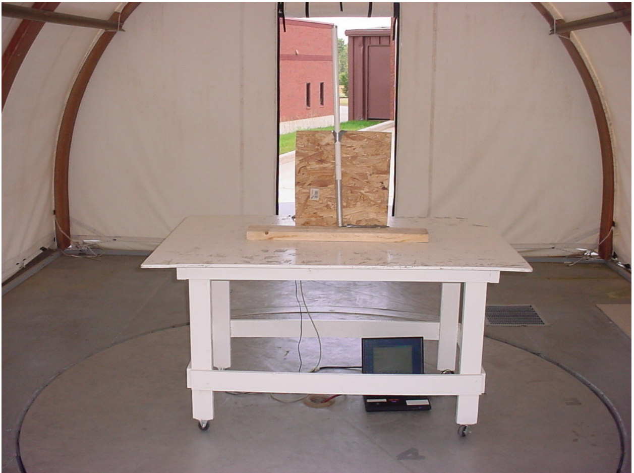
Figure 1: Dipole Antenna – Front View