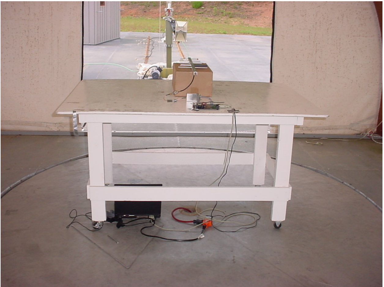
Figure 4: Yagi Antenna – Rear View