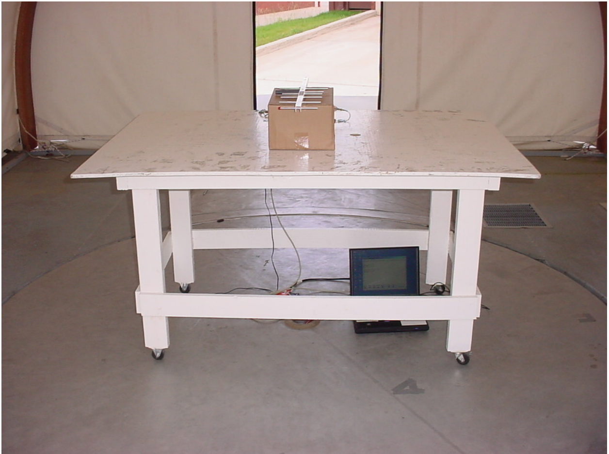
Figure 3: Yagi Antenna – Front View