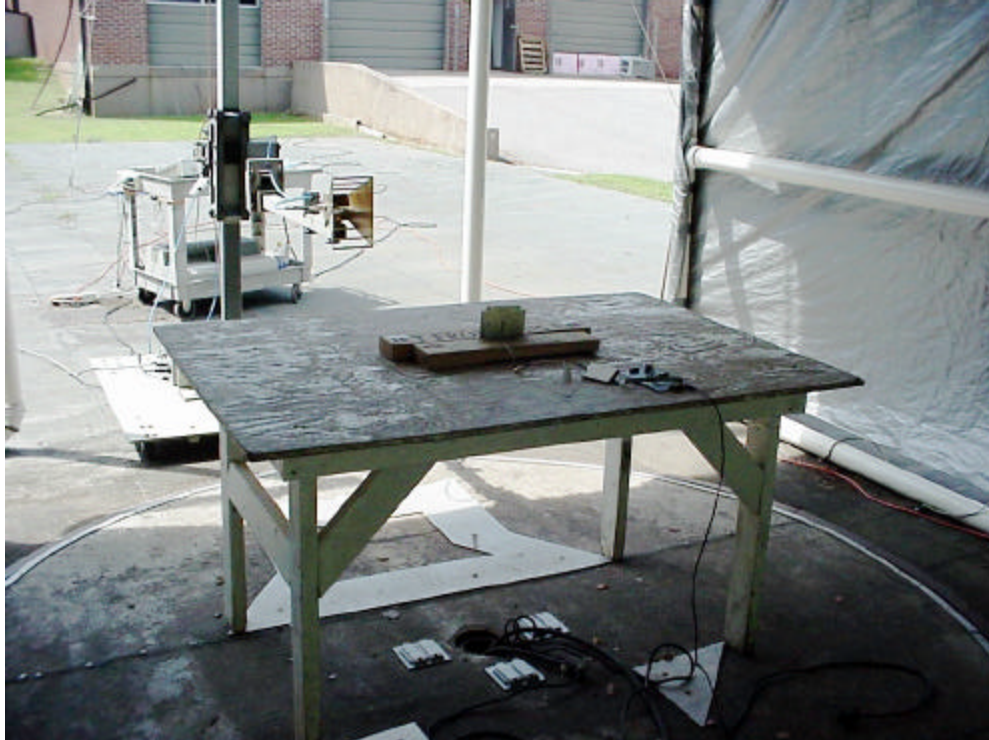
FIGURE 2e Photograph(s) for Spurious Emissions (Large Patch Antenna)

Test Date: February 2, 2006 UST Project: 06-0003 Customer: Cirronet Corporation Model: WIT 2450