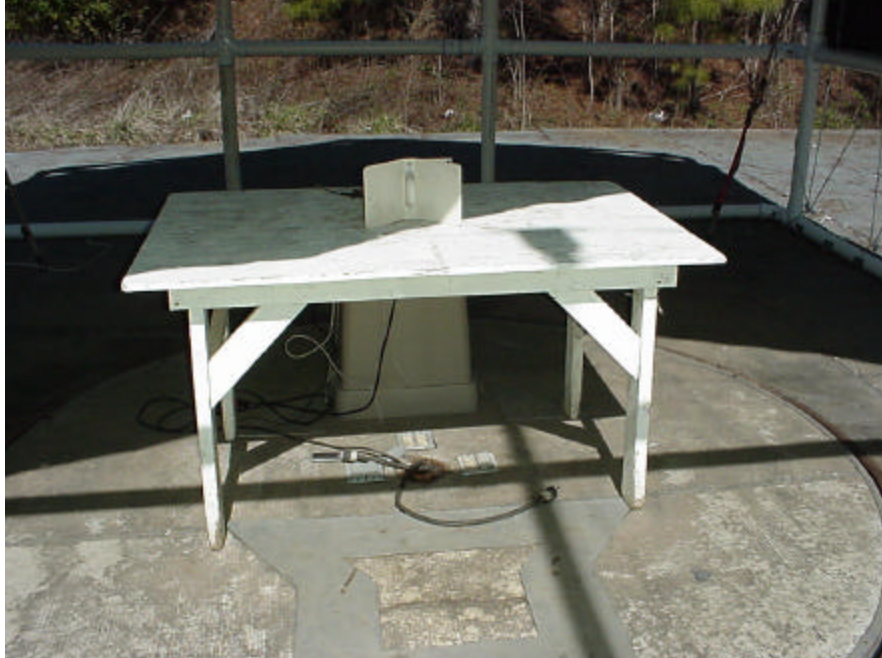
Photograph(s) for Spurious Emissions (Corner Reflector Antenna)