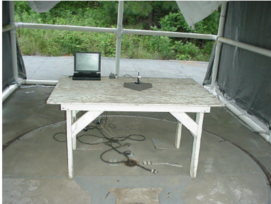
FIGURE 2g Photograph(s) for Spurious Emissions (Dipole Antenna)

Test Date: February 2, 2006 UST Project: 06-0003 Customer: Cirronet Corporation Model: WIT 2450