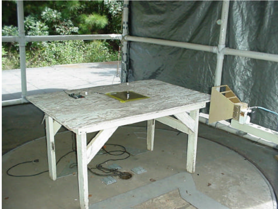
Photograph(s) for Spurious Emissions (Whip Antenna)