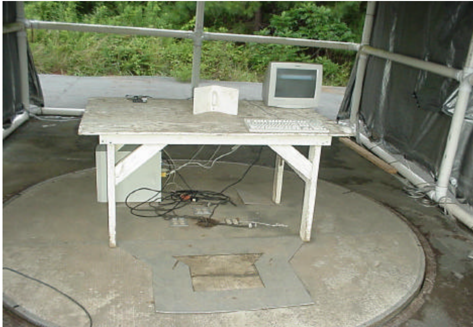
Photograph(s) for Spurious Emissions (Corner Reflector Antenna)