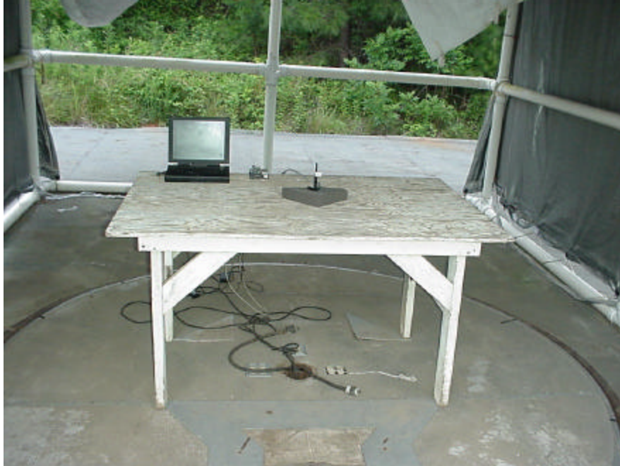
Photograph(s) for Spurious Emissions (Dipole Antenna)