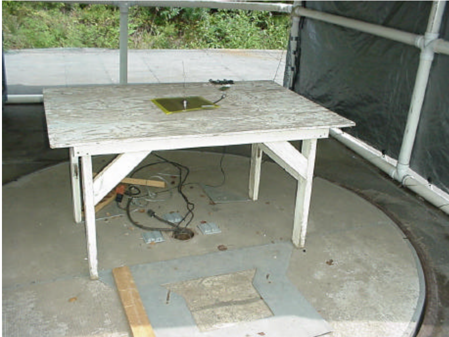
Photograph(s) for Spurious Emissions (Whip Antenna)