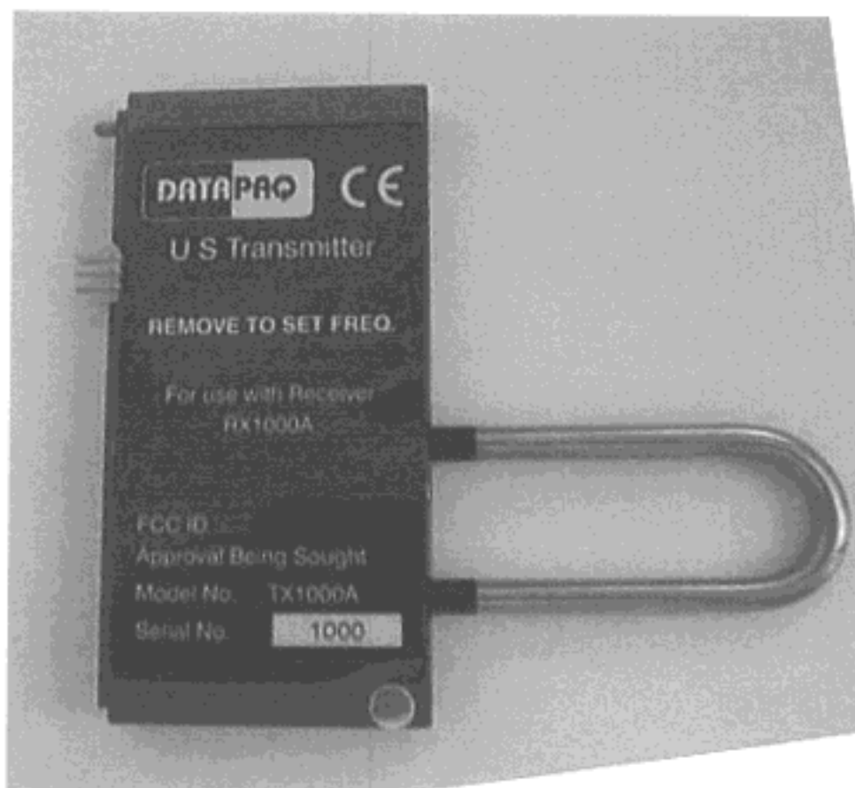
Exhibit 1: Rear view of transmitter showing design of product label and its location.