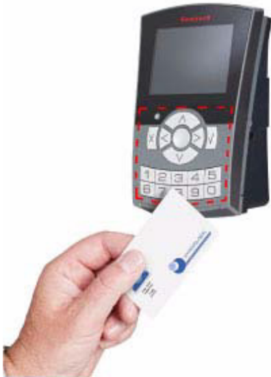
Figure 1. The reader verifies the permissions configured for the card.

Hold the card a few centimeters from the reader in the highlighted area in, the device will check the card type, then check the card is access right by database list, justify whether the card is register in system, then whether open the door, and give the information on the device LCD panel and give alarm sound by speaker. Detail information please reference Voyager user guide.