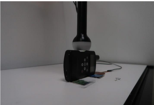
Left Side test at 0mm