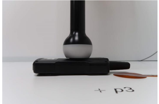
Back test at 0mm