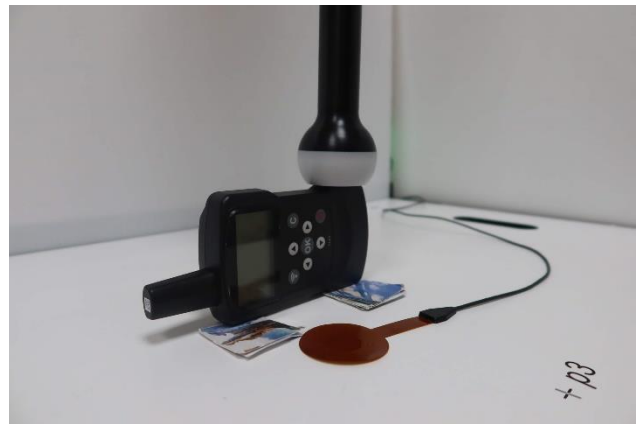
Right Side test at 0mm