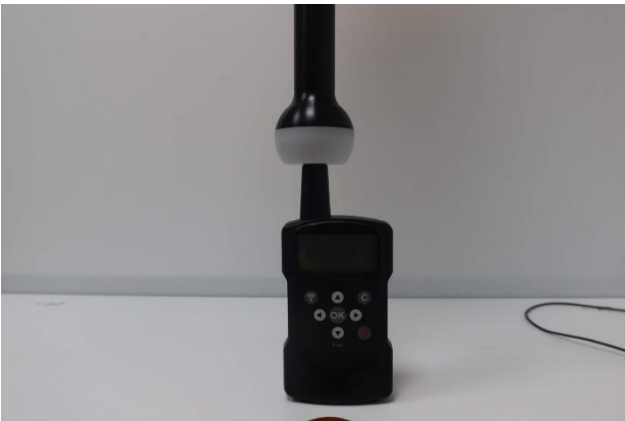
Top Side test at 0mm