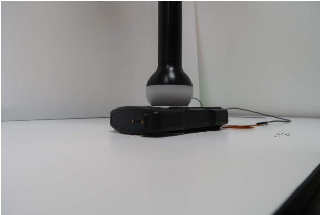
Front test at 0mm