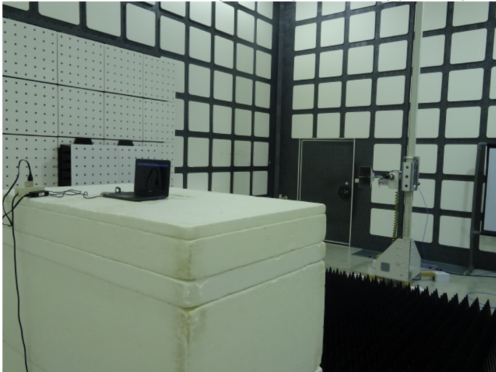
Radiated Emission Set up Photos (Front View)