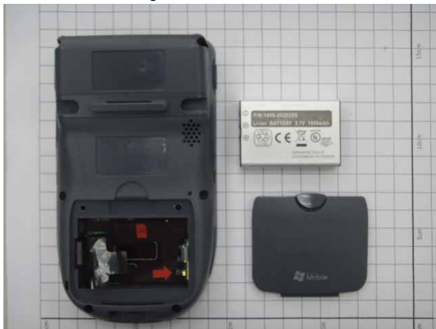
Fig.10 Back view of device