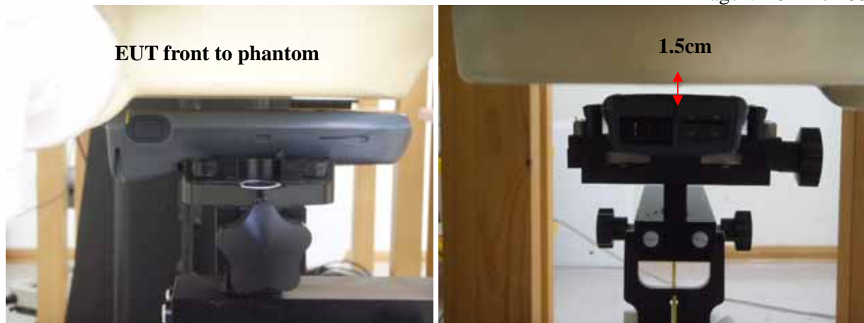
Fig.7 Body worn- EUT front to flat phantom and distance between flat phantom and mobile phone is 1.5 cm