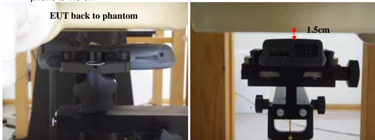
Fig.8 Body worn- EUT back to flat phantom and distance between flat phantom and mobile phone is 1.5 cm