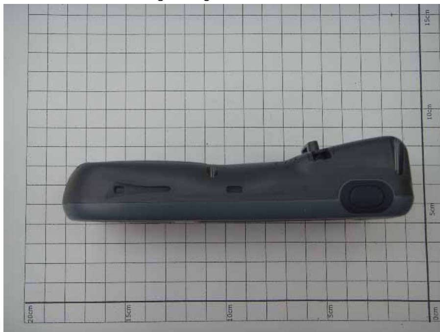
Fig.12 Left side view of device