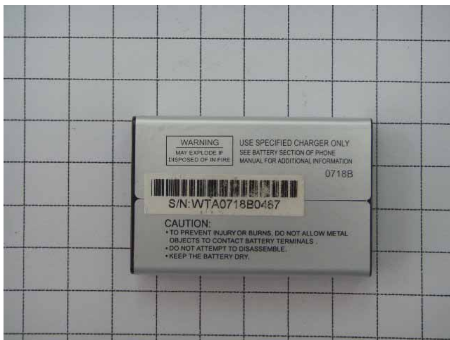
Fig.14 Back view of Battery