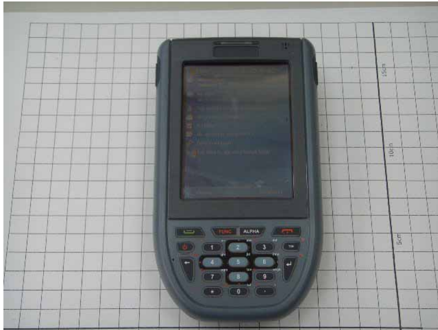
Fig.9 Front view of device