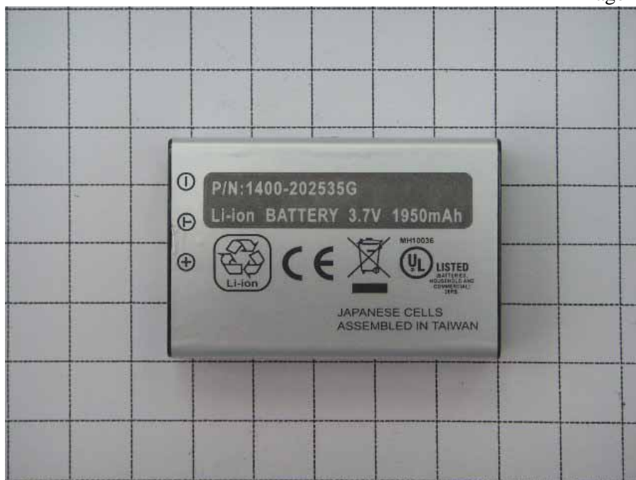
Fig.13 Front view of Battery