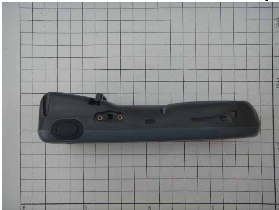
Fig.11 Right side view of device