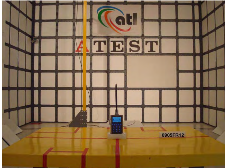
Front View of the Test Configuration