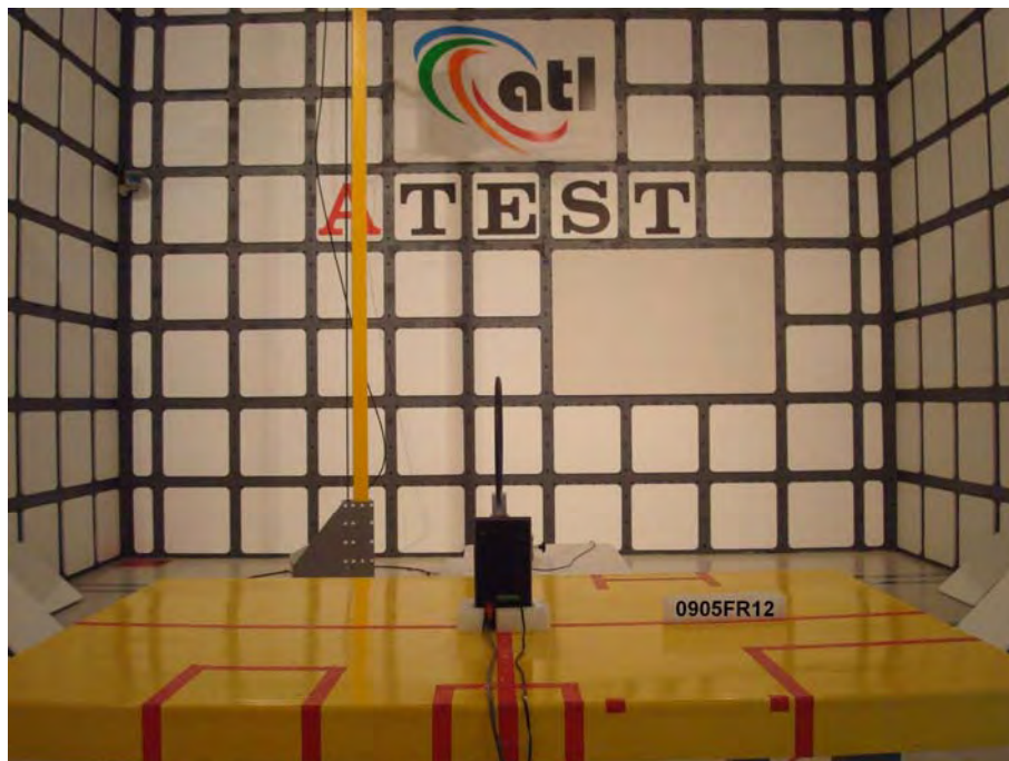
Rear View of the Test Configuration