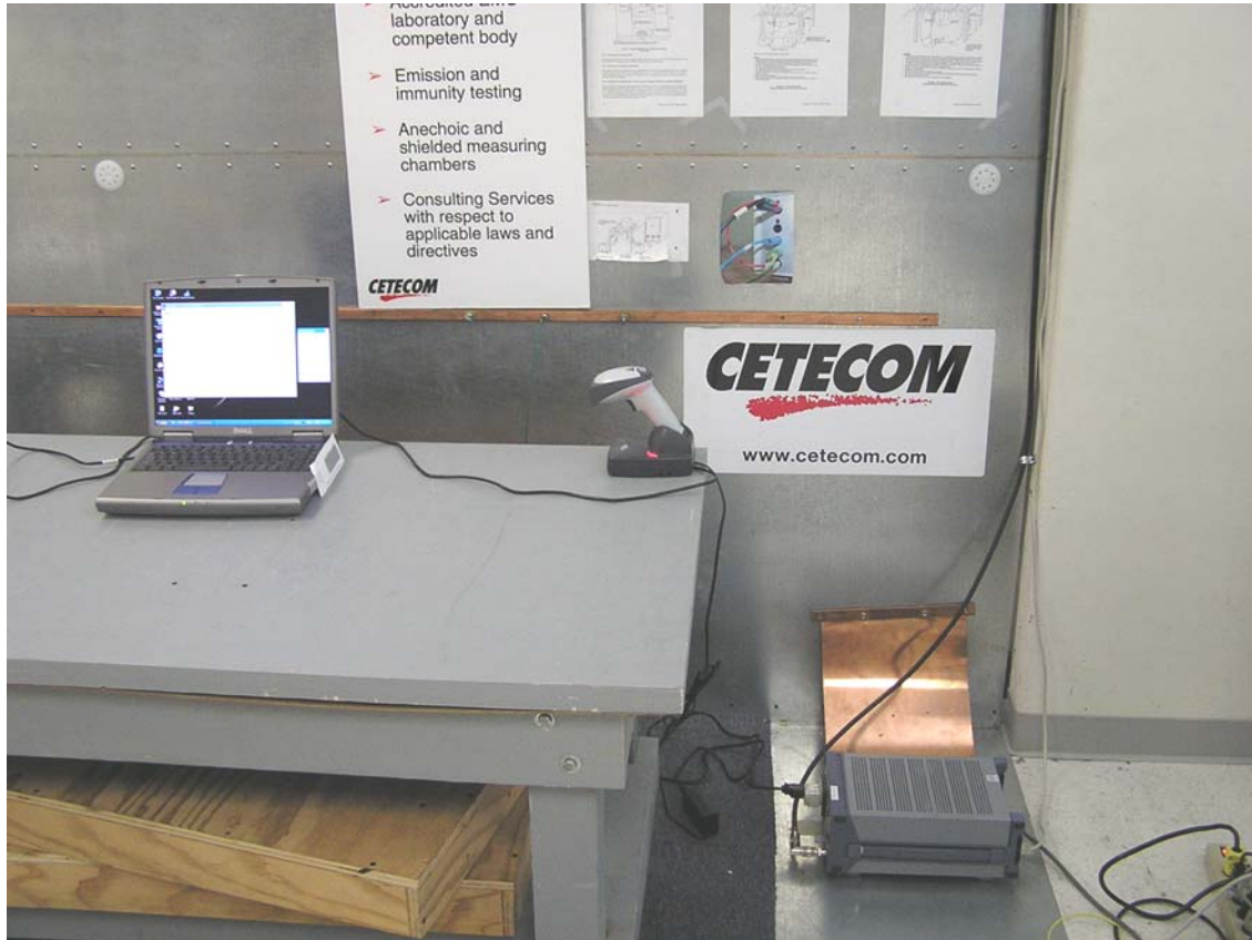
Test setup – AC Line Conducted Emissions