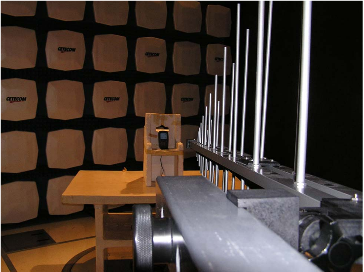
RADIATED EMISSIONS - Back