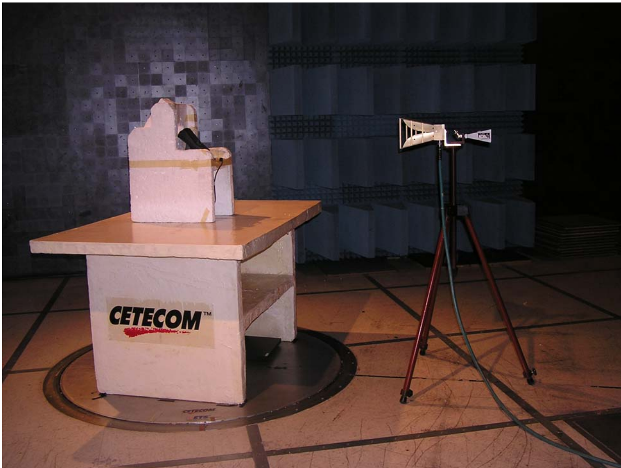
RADIATED EMISSIONS - Front