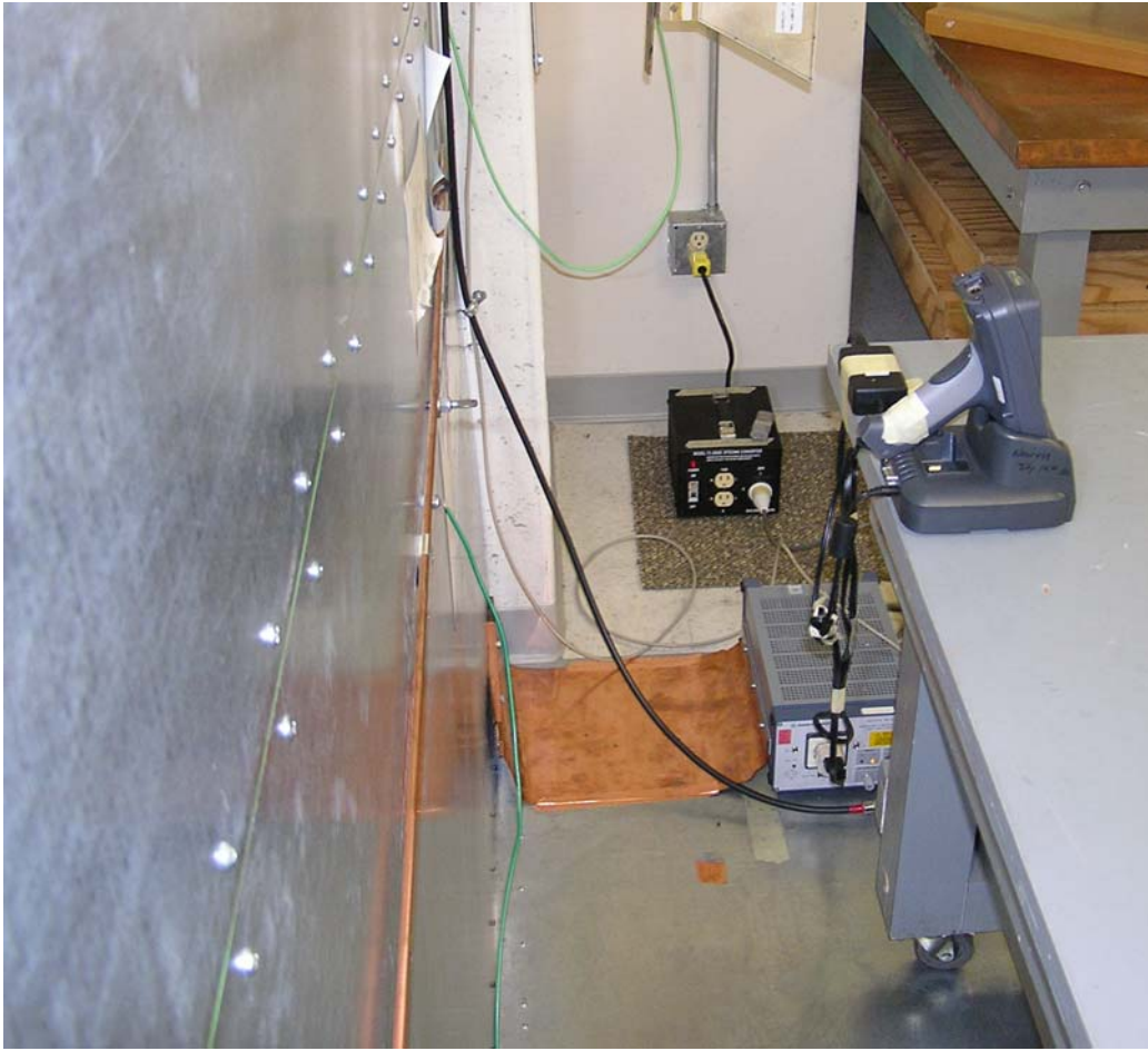
LINE CONDUCTED EMISSIONS – BACK