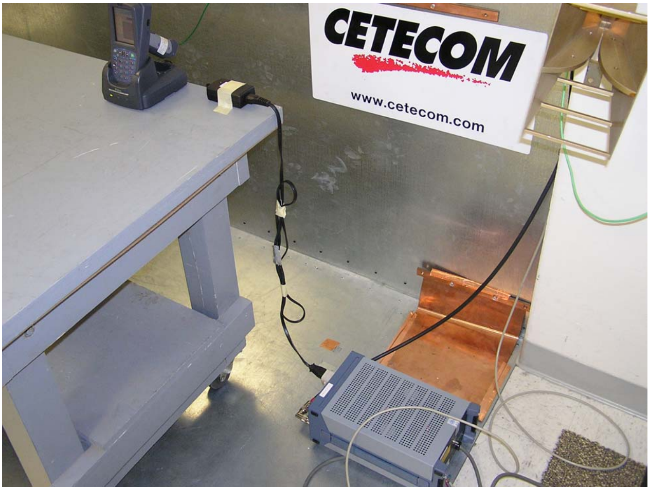
AC LINE CONDUCTED EMISSIONS - FRONT