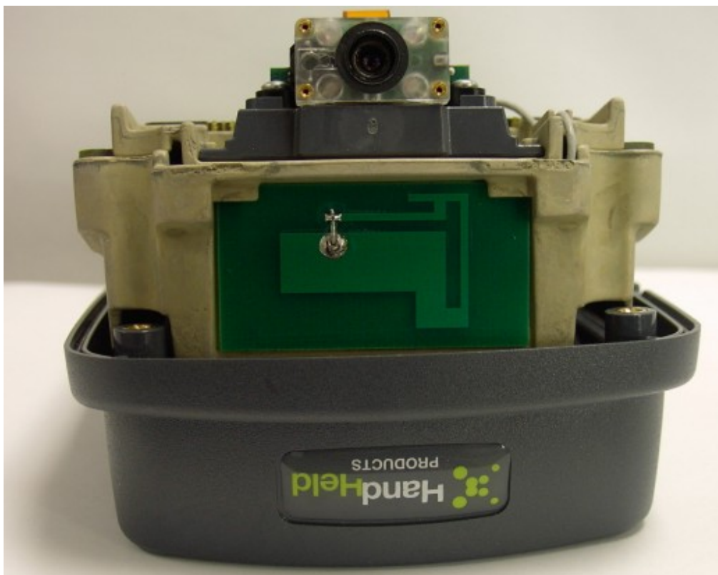
7850 “L0GE” 802.11g Antenna Placement Internal