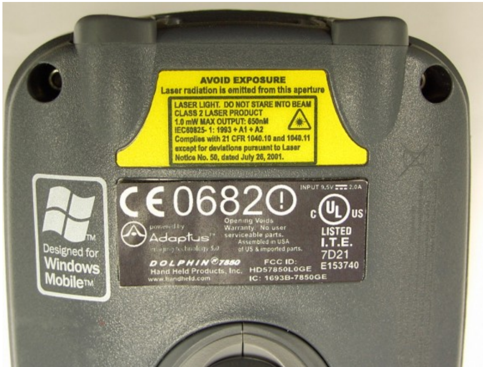
7850 “L0GE” Label Placement