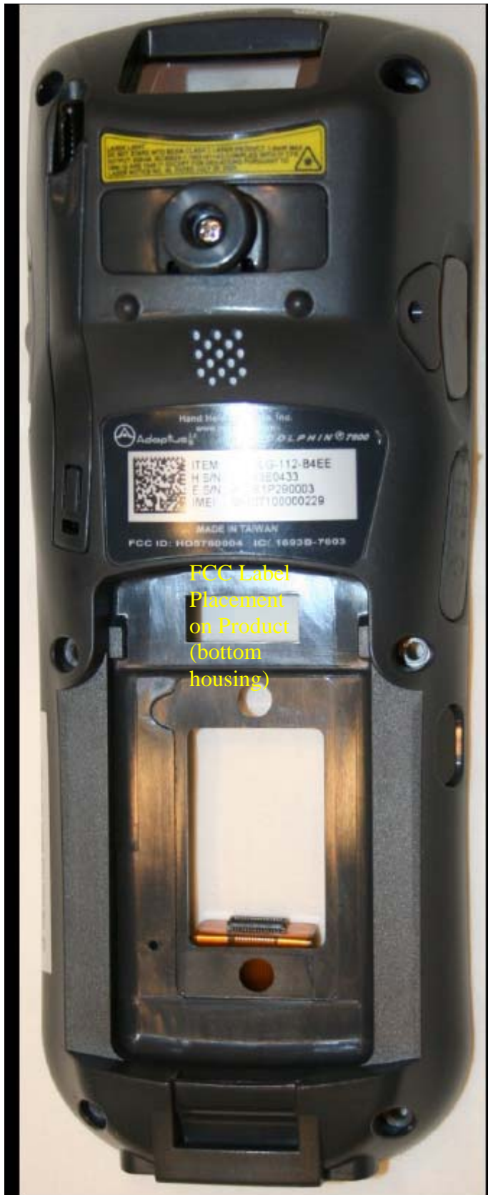
FCC Label Placement on Product (bottom housing)