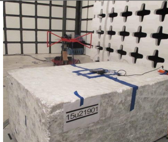
RADIATED BACK PHOTO (BELOW 1 GHz)