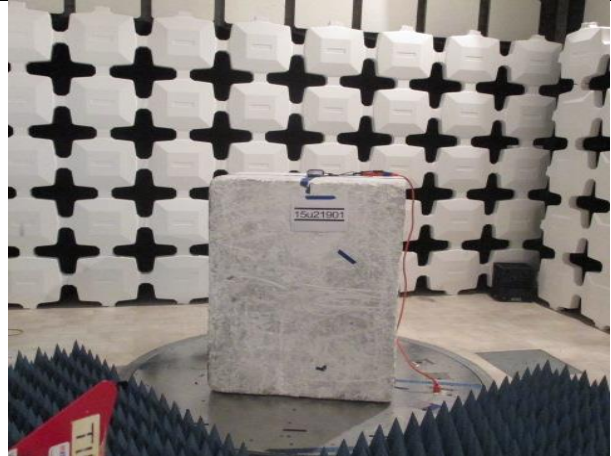
RADIATED BACK PHOTO (ABOVE 1 GHz)